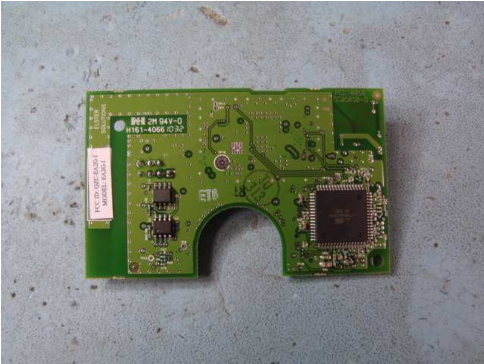
Figure 3: Location of Internal FCC Label on EA2G-I Printed Circuit Board Assembly