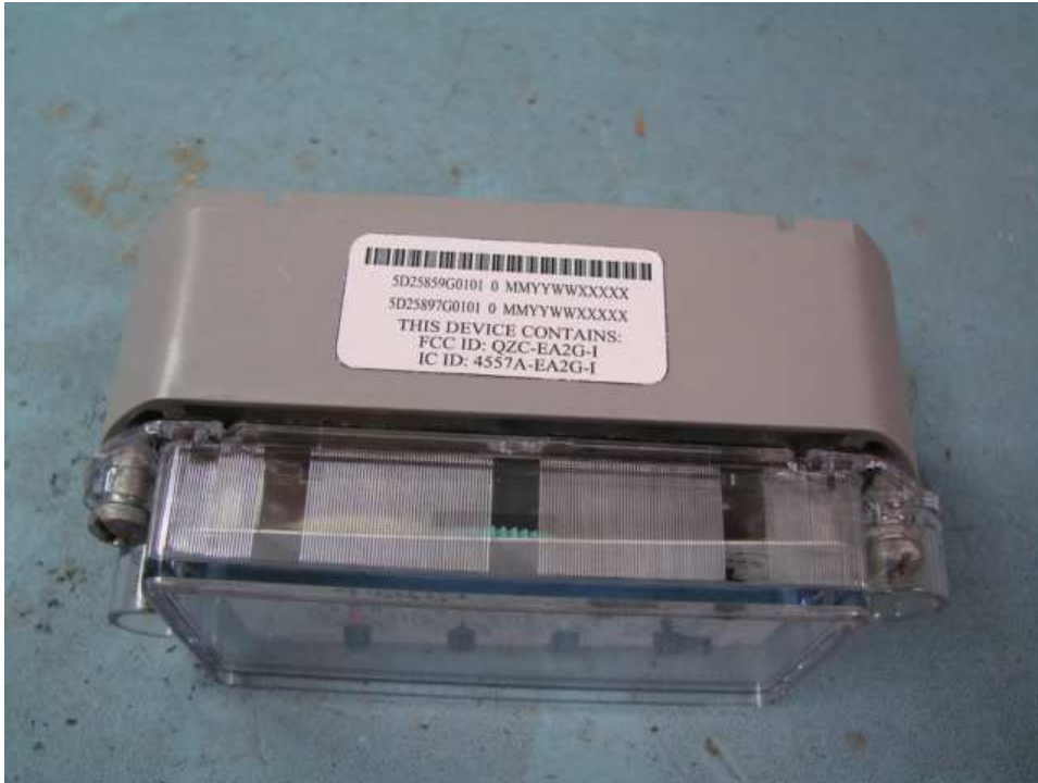
Figure 1: Location of External FCC label on EA2G-I Module

Note that the label in the photo is a facsimile, to scale, of the FCC ID label.