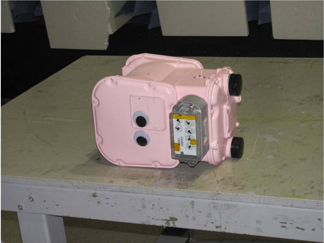
Orientation 2 investigated- Highest Emissions in this orientation