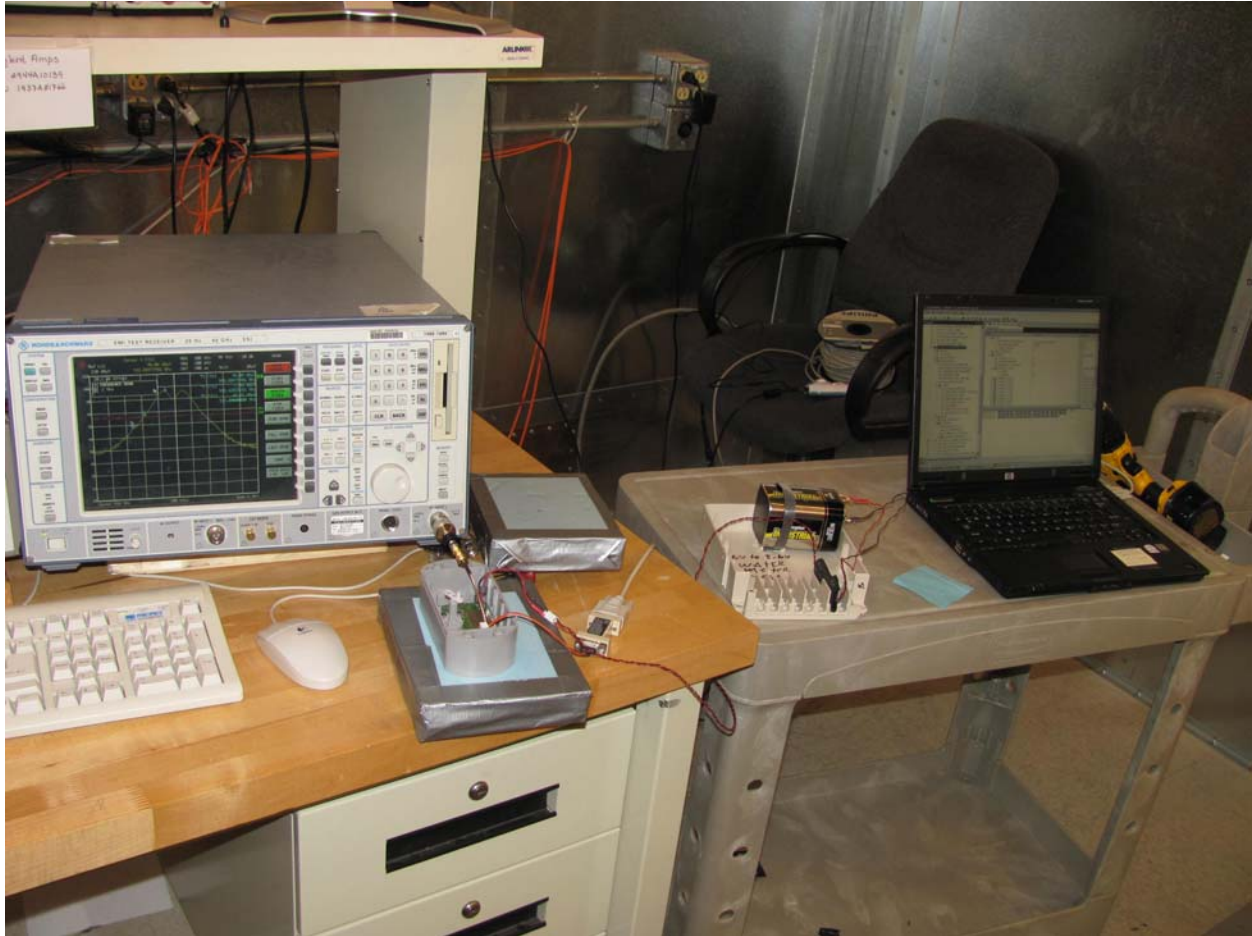
View of Test Setup Making direct RF Conducted measurements