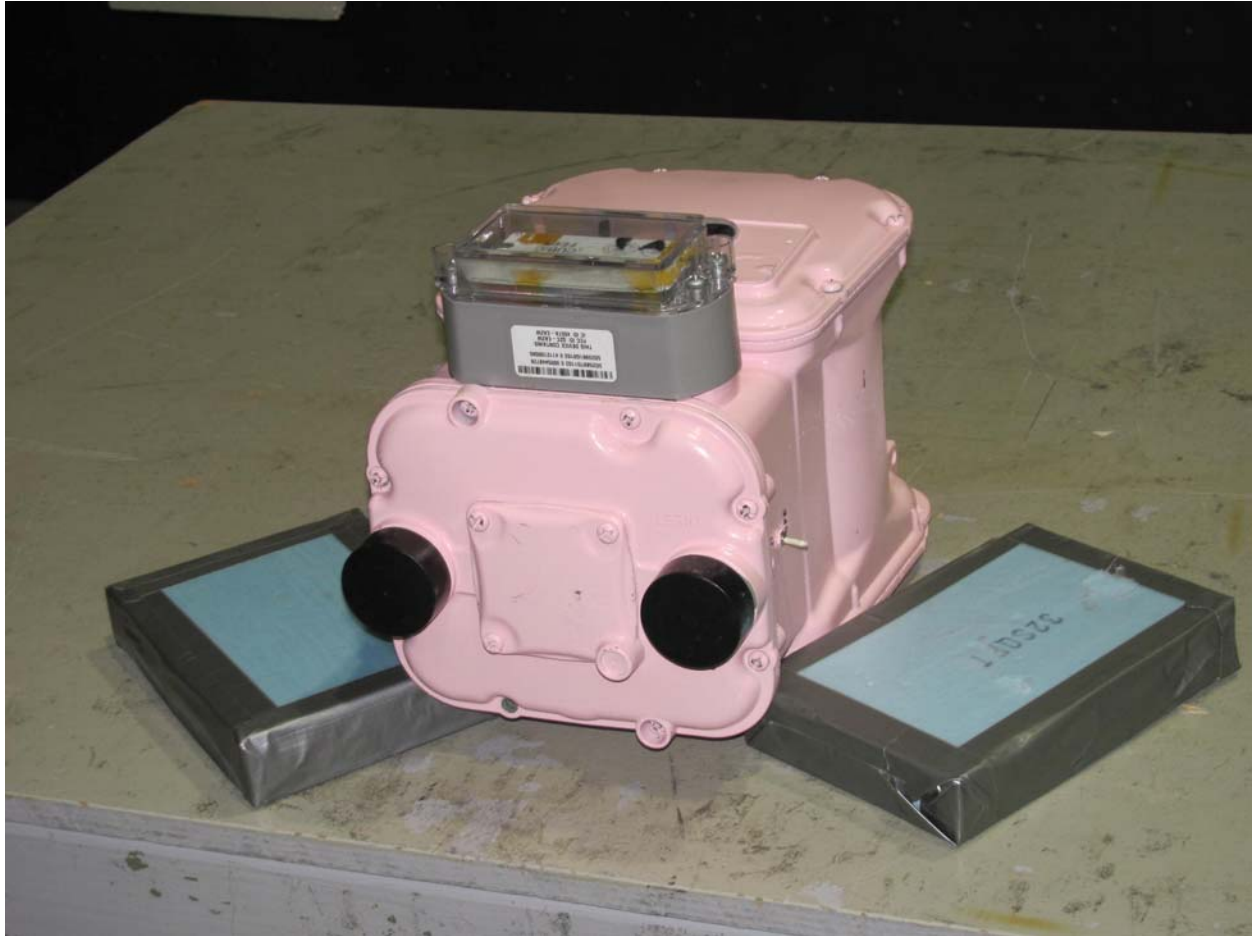
Orientation 3 investigated