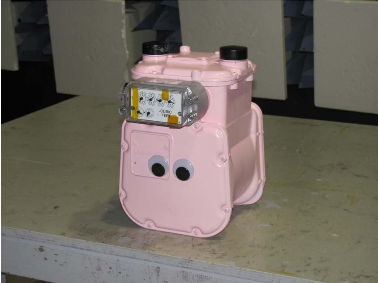
Orientation 1 investigated