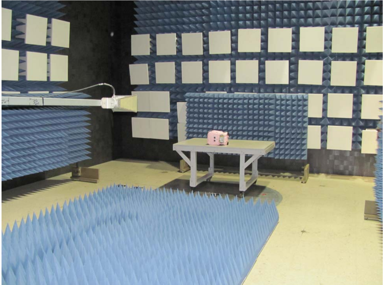
Front View of Radiated Emissions Test Setup - 1 GHz to 10 GHz