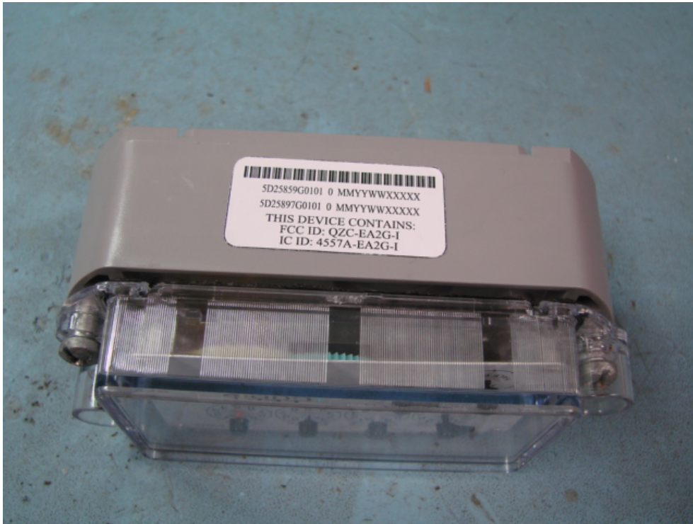
Figure 1: Location of External FCC label on EA2G-I Module

Note that the label in the photo is a facsimile, to scale, of the FCC ID label.