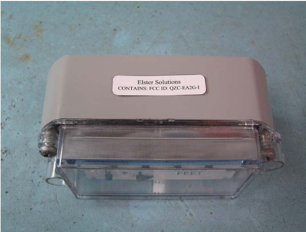
Figure 1: Location of External FCC label on EA2G-I Module

Note that the label in the photo is a facsimile, to scale, of the FCC ID label.