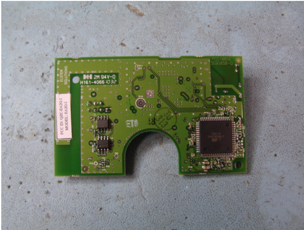
Figure 3: Location of Internal FCC Label on EA2G-I Printed Circuit Board Assembly