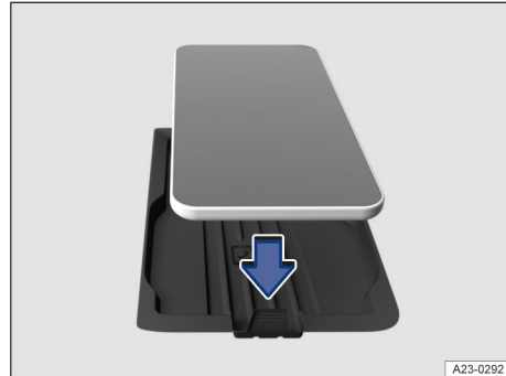
Fig. 146 In the center console: storage for wireless charging function (general example).

The wireless charging function depends on the vehicle equipment and is not available in all countries.