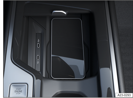
Fig. 147 In the center console: open cover of the storage compartment (general example).

The storage compartment for the wireless charging function may have a cover for the cell phone display.