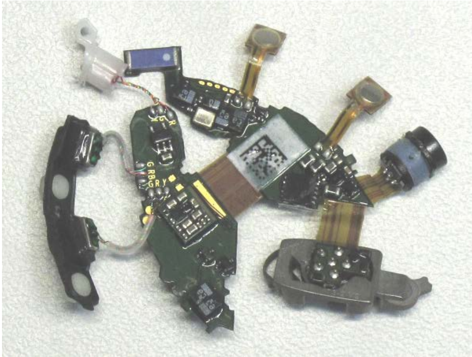
Circuit board, top side