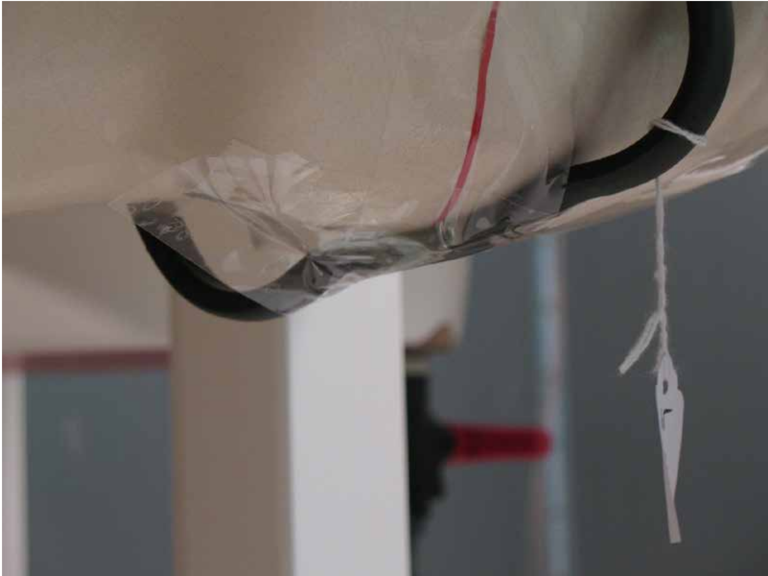
Figure 3: Side C