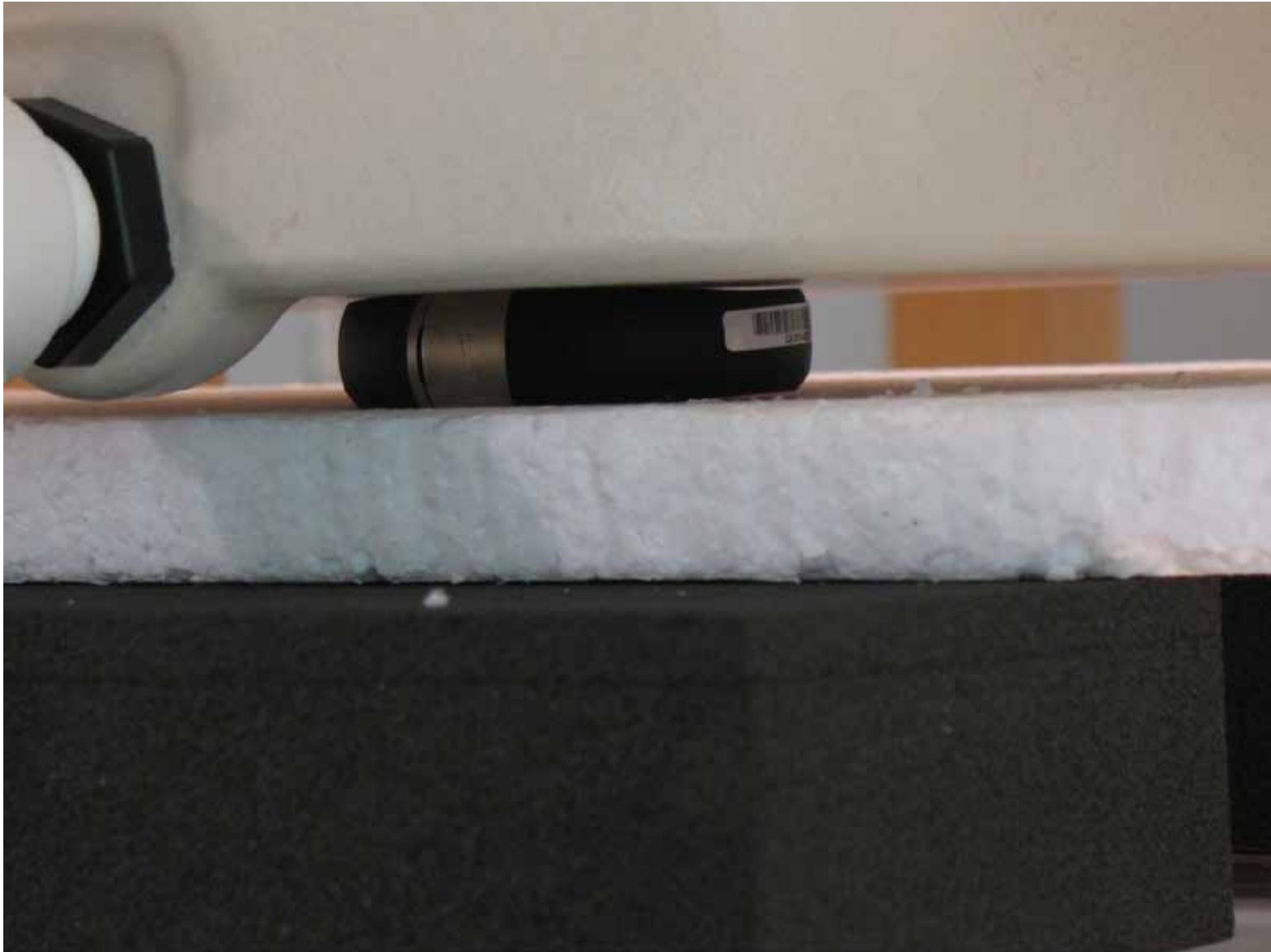
Figure 1: Side A