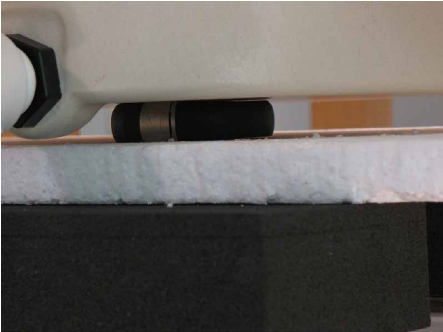
Figure 2: Side B