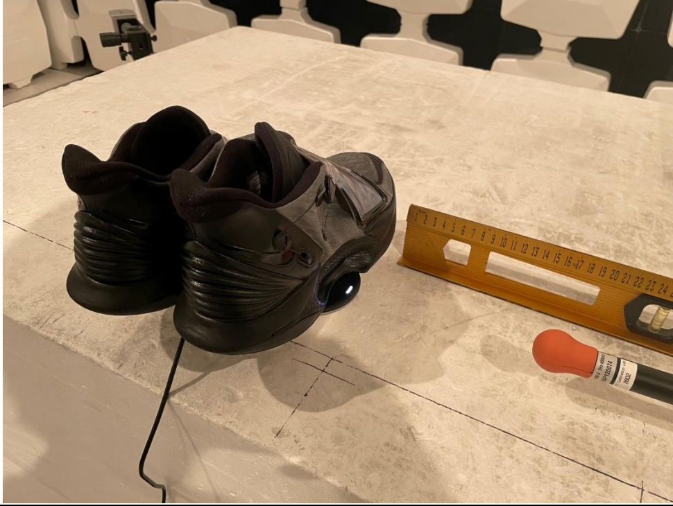
Front / Rear