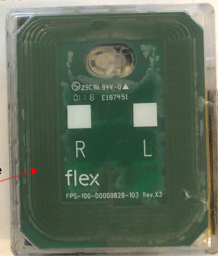
Left Lace Engine