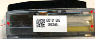
Left Lace Engine