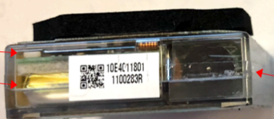
Right Lace Engine