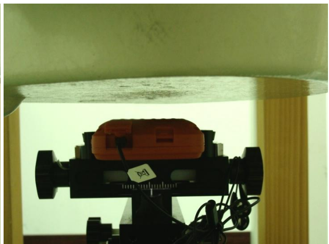
Bottom of the DUT with Phantom 1.5 cm Gap