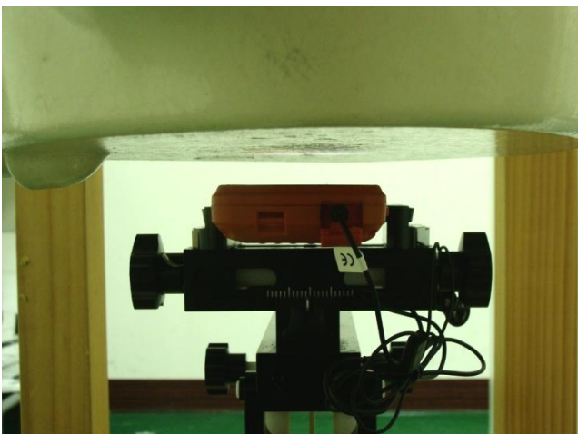
Face of the DUT with Phantom 1.5 cm Gap