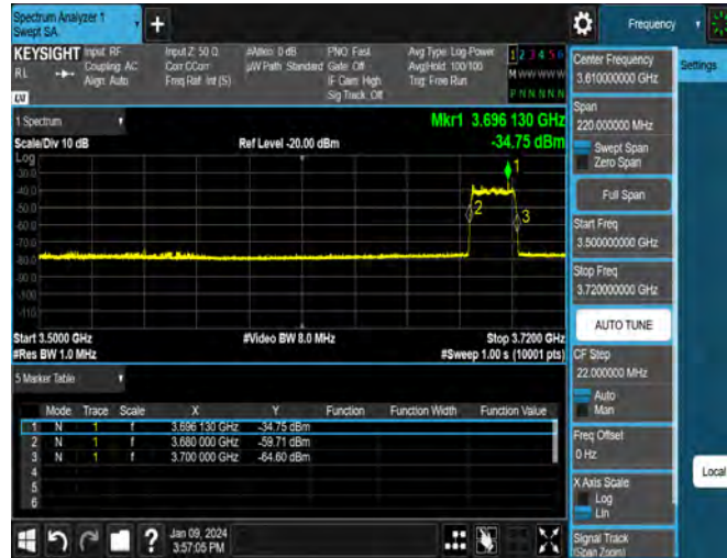
Band48-20MHz-CH56640_Idle With 10s