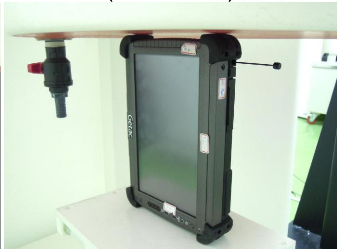
Secondary Portrait with 0 cm Gap (Antenna Extended)