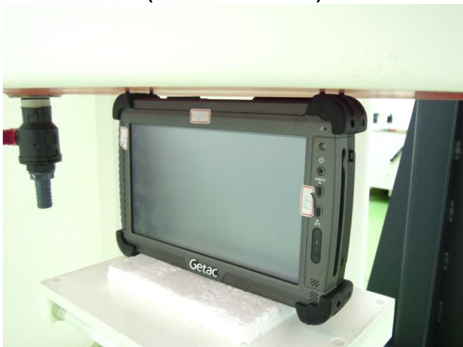
Secondary Landscape with 0 cm Gap (Antenna Retracted)