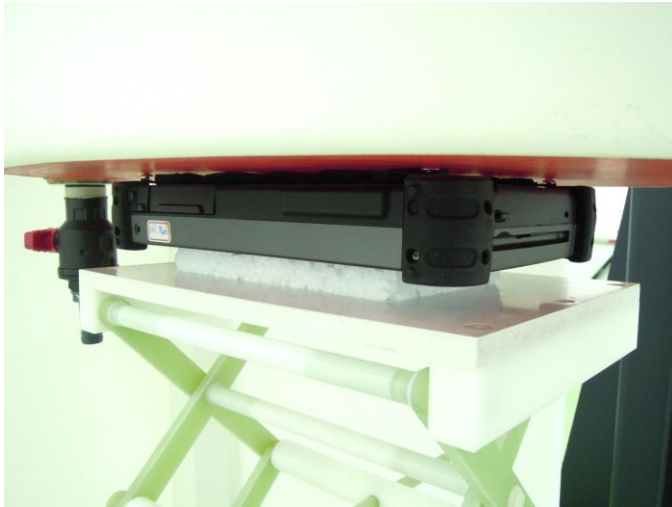
Bottom of Tablet with 0 cm Gap (Antenna Retracted)