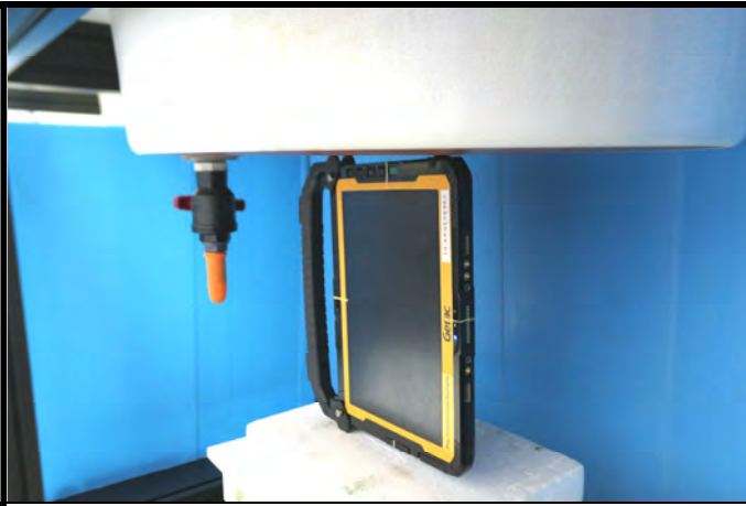
Right Side with Handle of Tablet Mode Tested at 0 mm