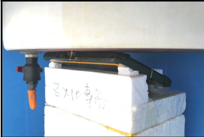
Rear Curve 0 of Tablet Mode Tested at 0 mm