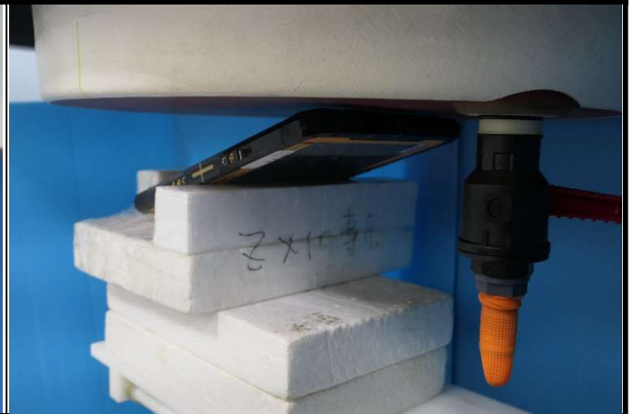
Right Curve 1 of Tablet Mode Tested at 0 mm