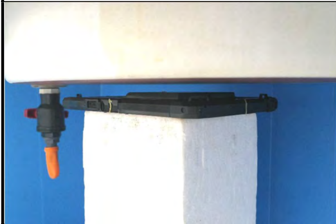
Rear Face of Tablet Mode Tested at 12 mm