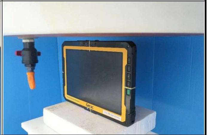
Top Side of Tablet Mode Tested at 10 mm