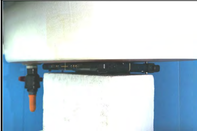
Front Face with Handle of Tablet Mode Tested at 0 mm