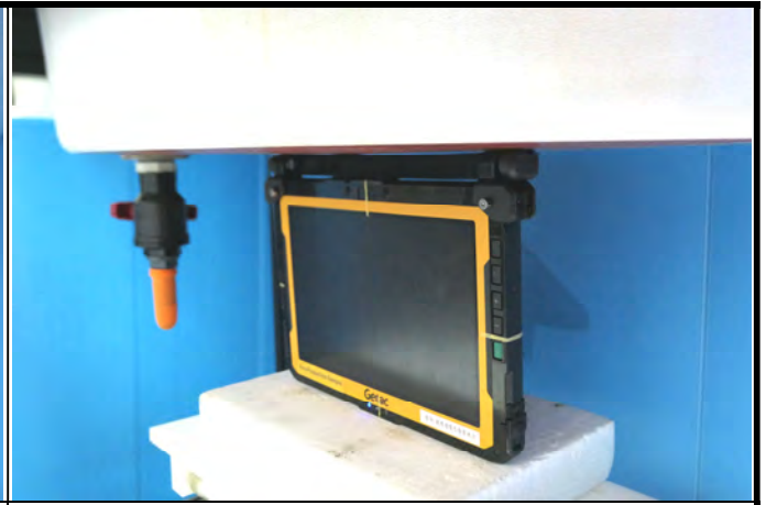
Top Side with Handle of Tablet Mode Tested at 0 mm