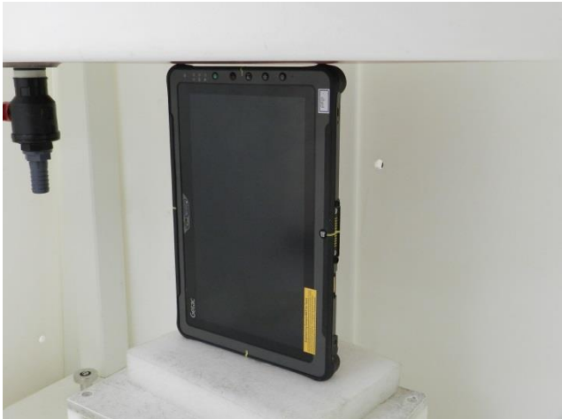
Edge2, Test Separation 0 mm