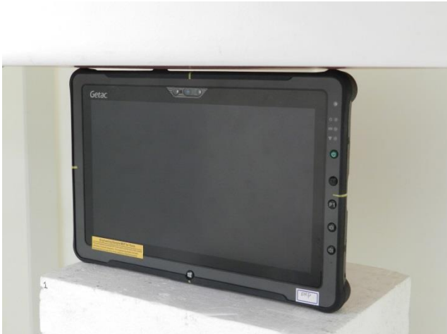
Edge1, Test Separation 0 mm