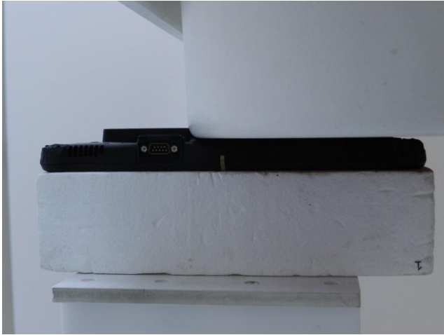
Bottom Face, Test Separation 0 mm