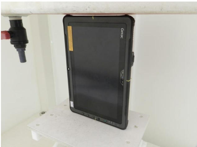
Edge4, Test Separation 0 mm