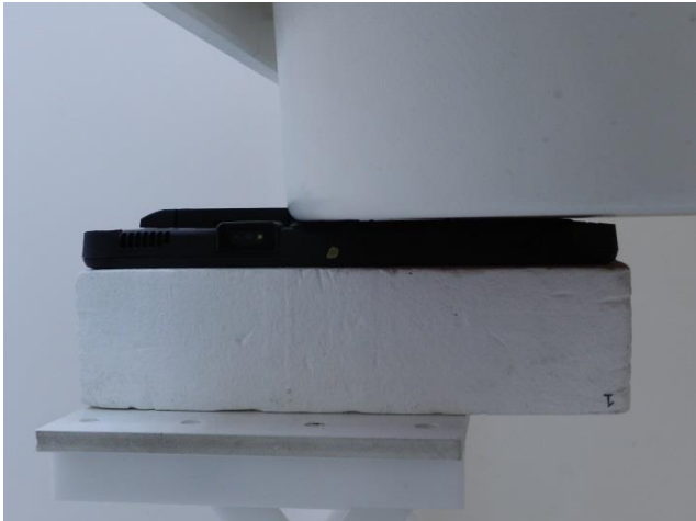
Bottom Face, Test Separation 0 mm