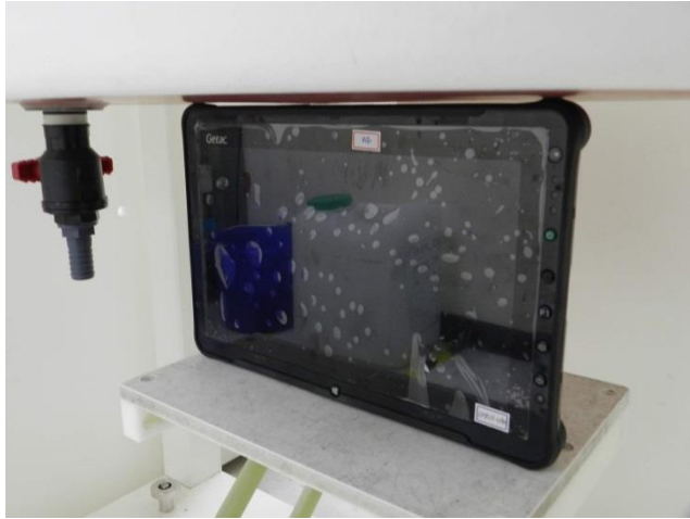
Edge1, Test Separation 0 mm