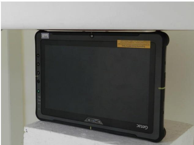
Edge3, Test Separation 0 mm