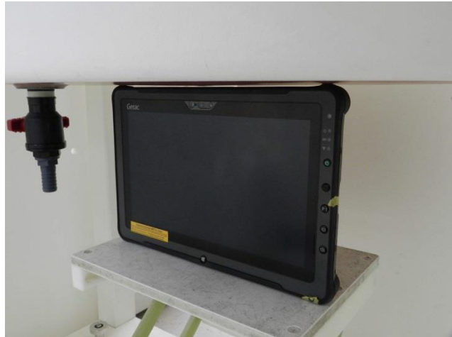
Edge1, Test Separation 0 mm