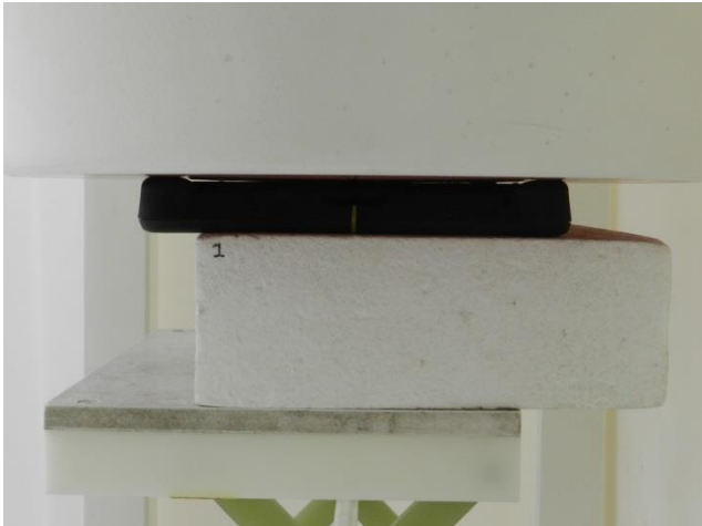
Bottom Face, Test Separation 0 mm