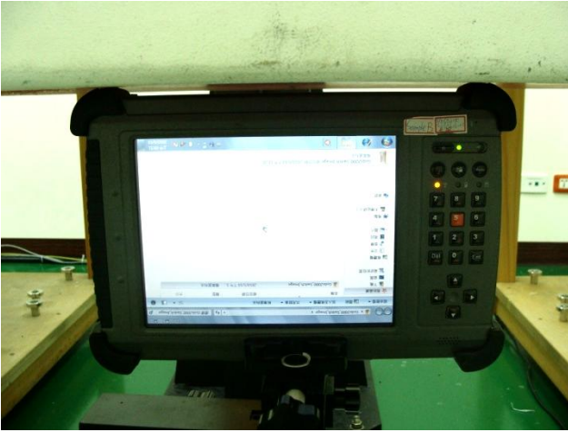
Secondary Landscape (Antenna Retracted)