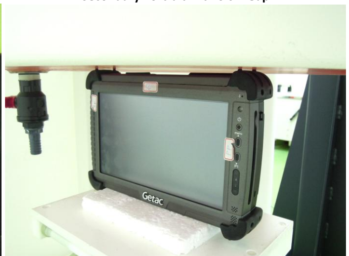
Secondary Landscape with 0 cm Gap