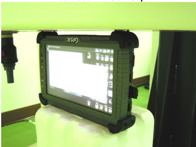
Primary Landscape with 0 cm Gap