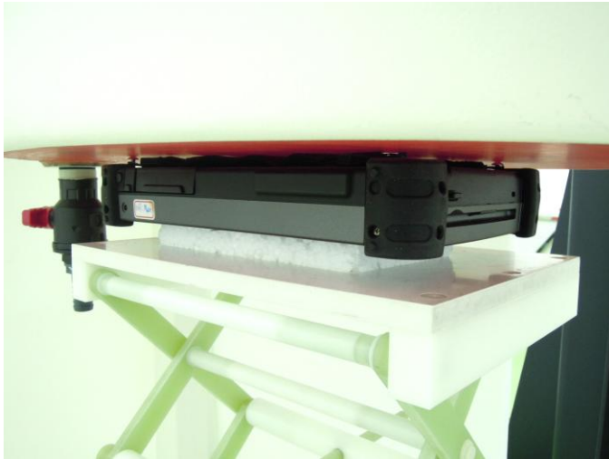
Rear Face with 0 cm Gap