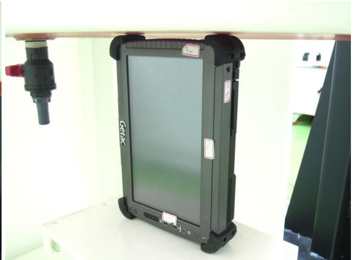
Secondary Portrait with 0 cm Gap