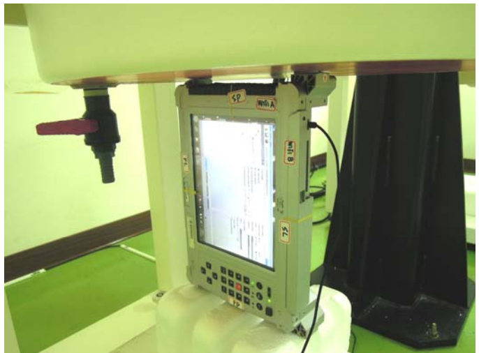
Secondary Portrait with 0 cm Gap