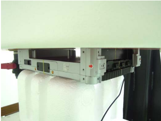
Rear Face with 0 cm Gap