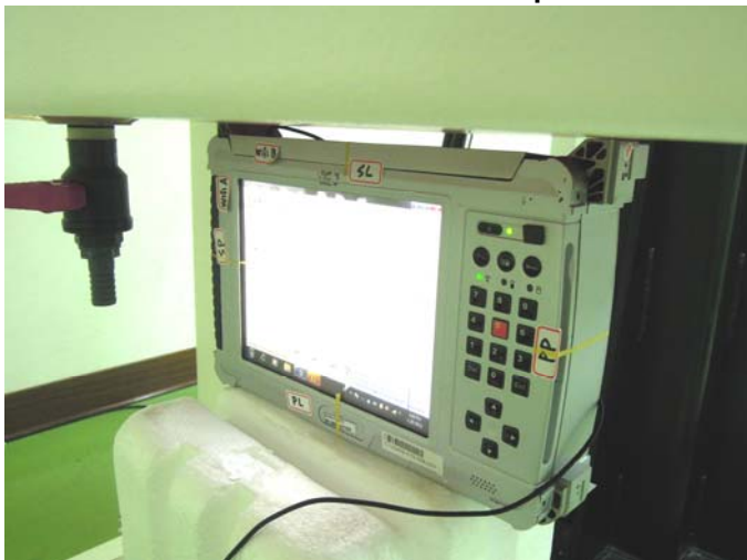
Secondary Landscape with 0 cm Gap