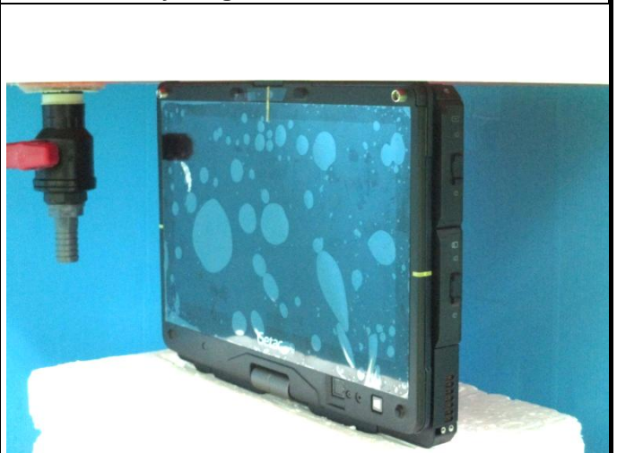
Body - Top Side of EUT at 0 mm