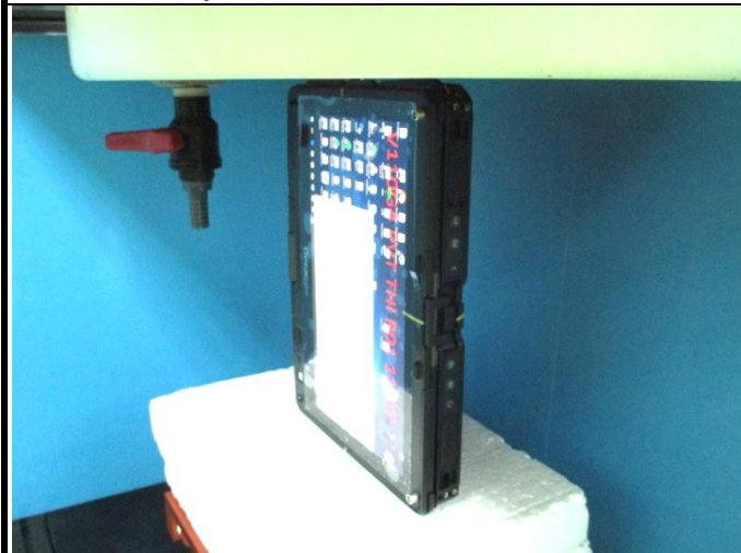
Body - Left Side of EUT at 0 mm