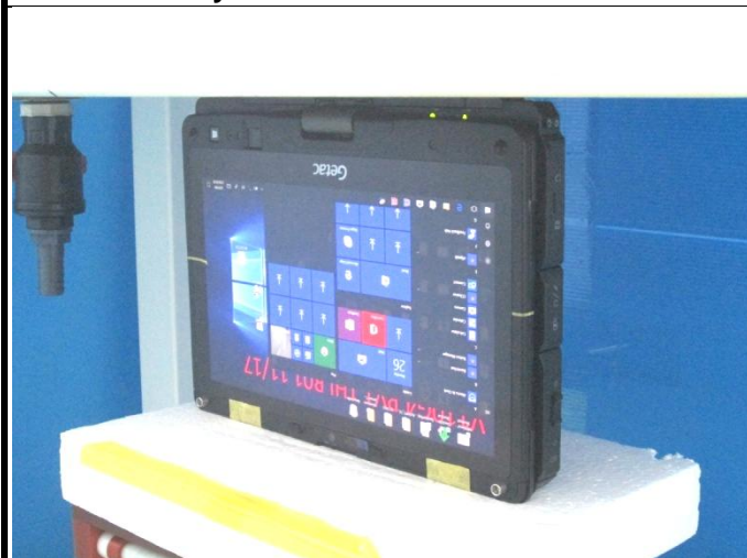
Body - Bottom Side of EUT at 0 mm