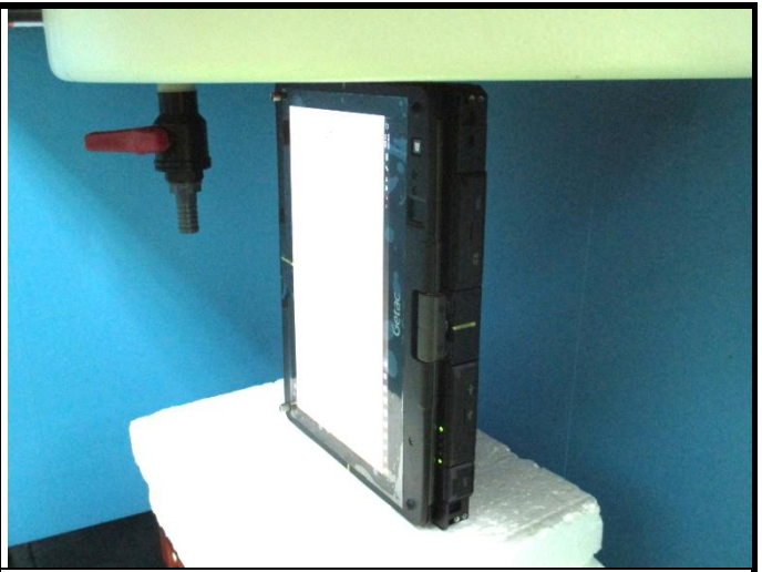
Body - Right Side of EUT at 0 mm