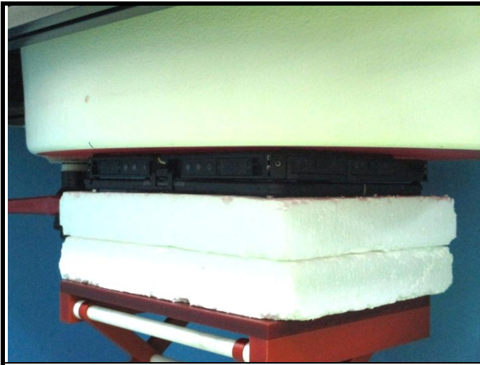
Body - Rear Face of EUT at 0 mm