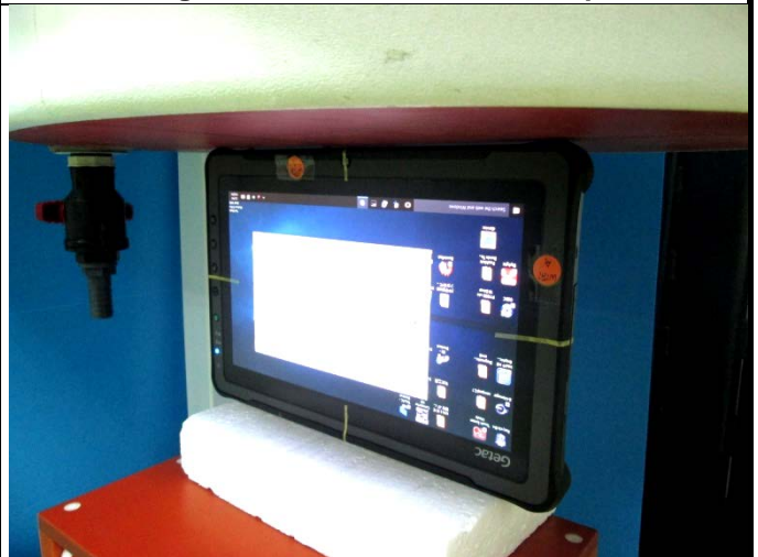
Bottom Side of EUT with 0 cm Gap