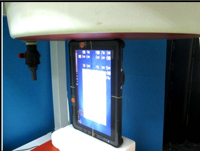
Left Side of EUT with 0 cm Gap