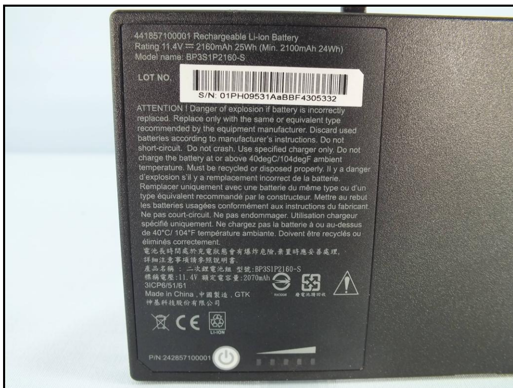
(with Battery 2)