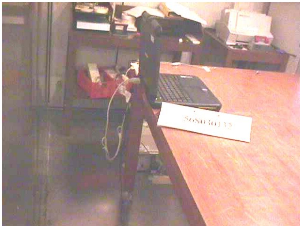
Conducted Emissions Setup (Rear View)