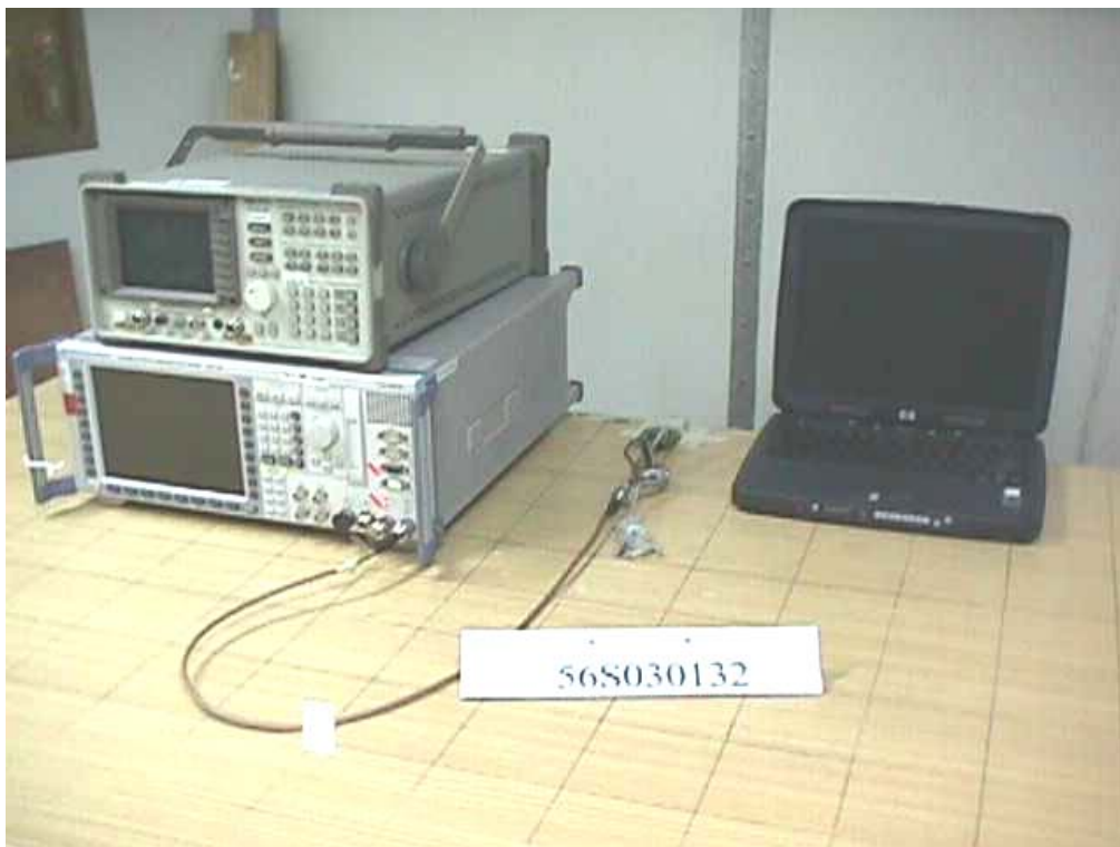
Spectrum Bandwidth Measurement Test Setup