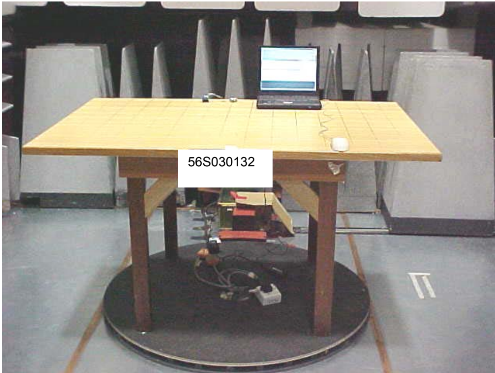
Radiated Emissions Setup (Front View)