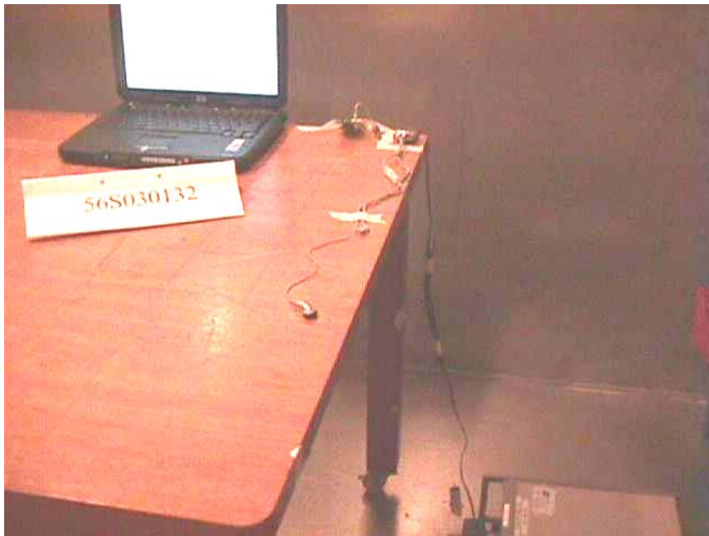
Conducted Emissions Setup (Front View)