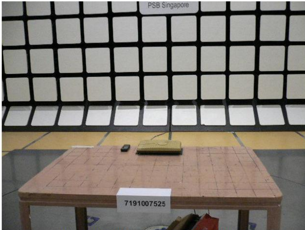
Radiated Emissions Test Setup (Front View)