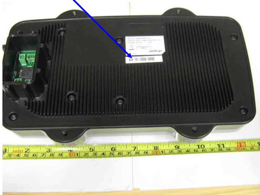
Physical Location of IC Label on EUT