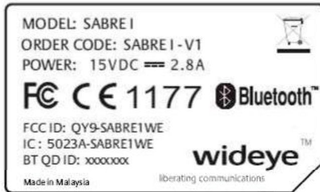
FCC ID Sample Label

The label shown will be permanently affixed at a conspicuous location on the device and be readily visible to the user at the time of purchase.