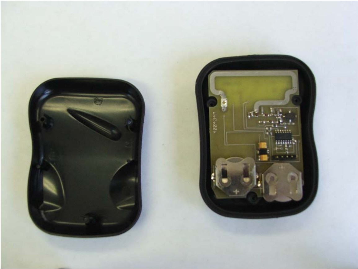
EUT COVER OFF FCC ID: QY4KTXW303