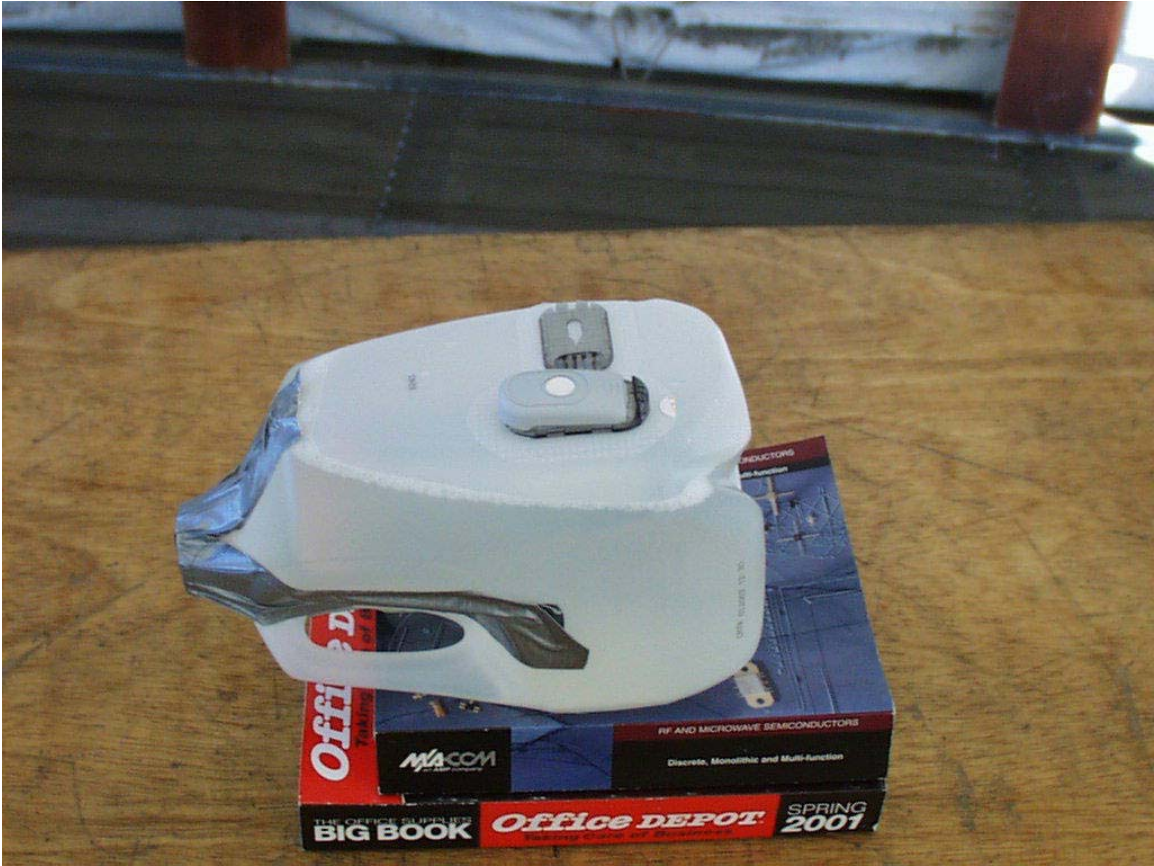
Transmitter in X – axis