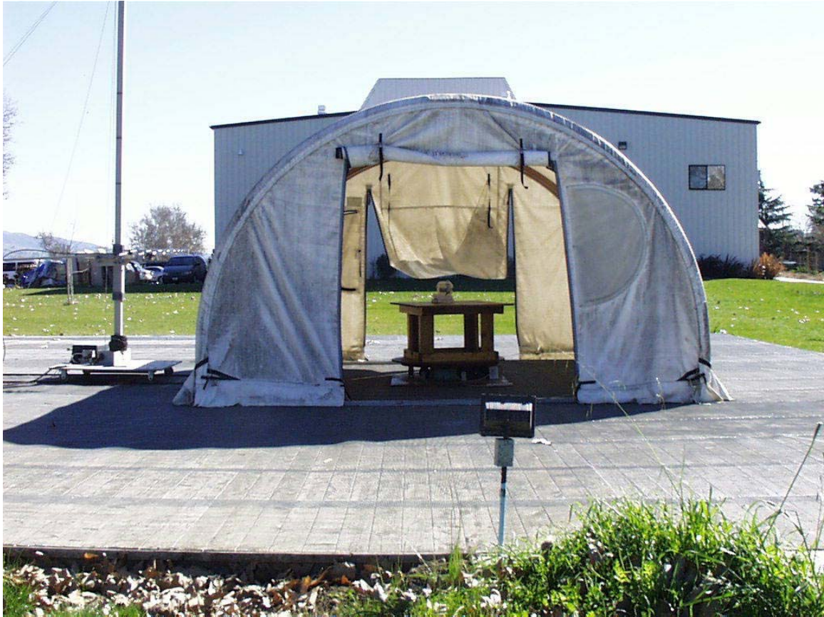
Radiated emissions test set-up