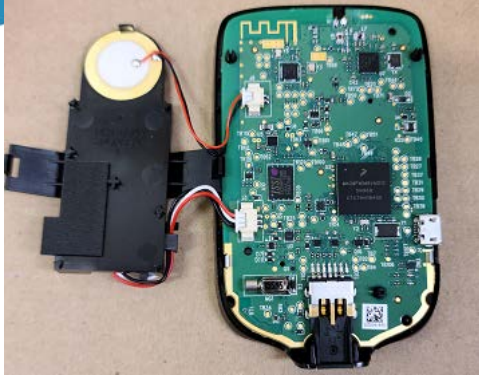
Photo 7- Internal Bottom View of Reader with Battery Clip Removed