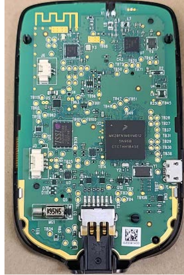
Photo 8- Internal Bare Bottom View of Reader