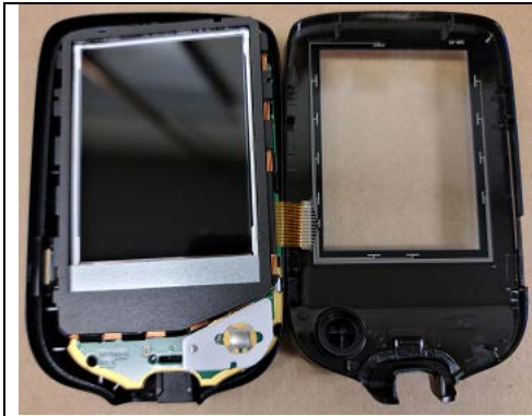
Photo 1- Internal Top View of Reader