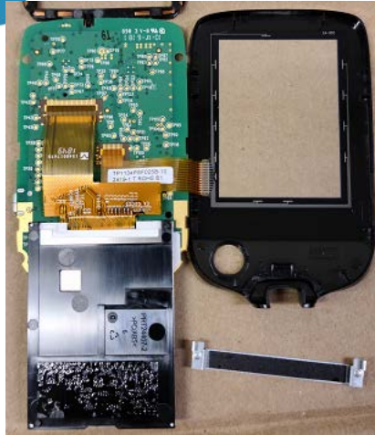
Photo 3- Internal Top View of Reader without Screen