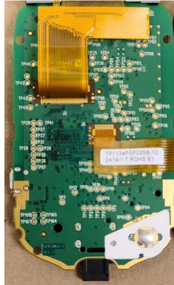
Photo 4- Internal Top View of Reader with Screen Removed