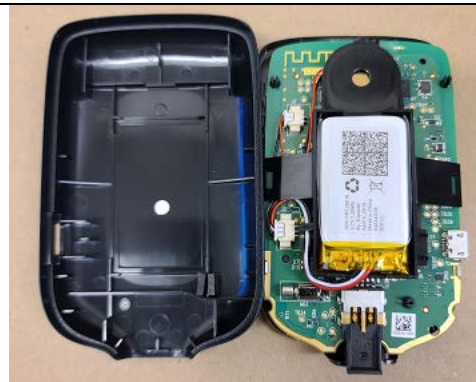
Photo 6- Internal Bottom View of Reader