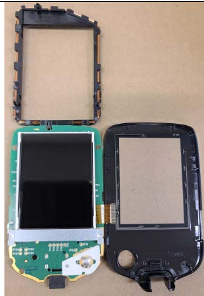
Photo 2- Internal Top View of Reader with Bobbin Removed