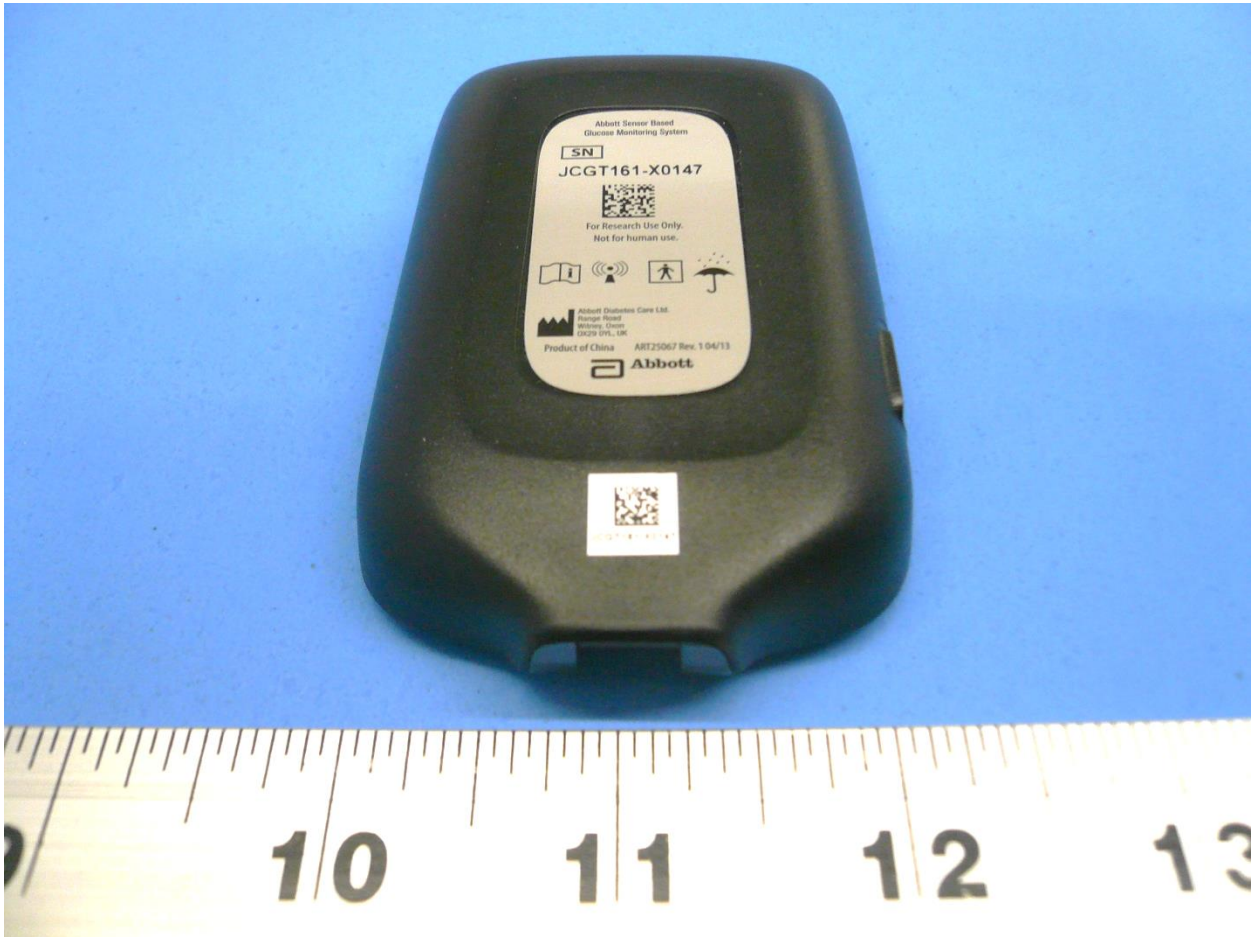
Figure 3: External Photo of EUT (Side)