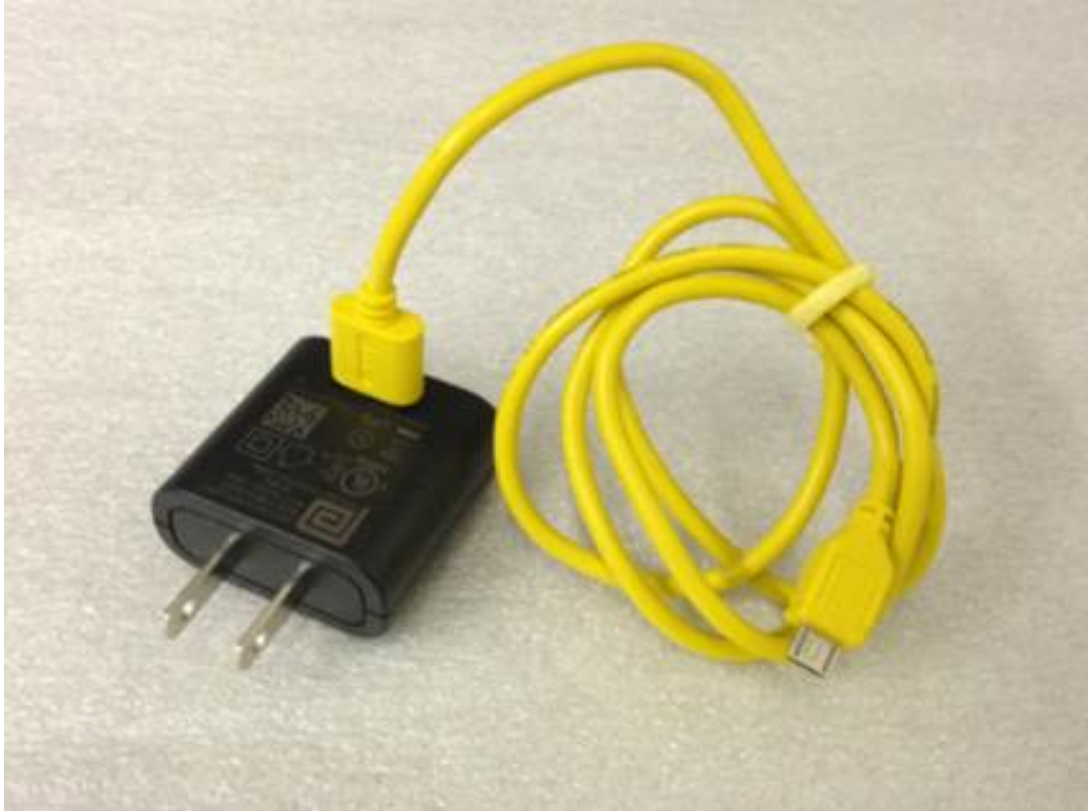
Figure 6 – View of Power Supply Adapter with USB cord