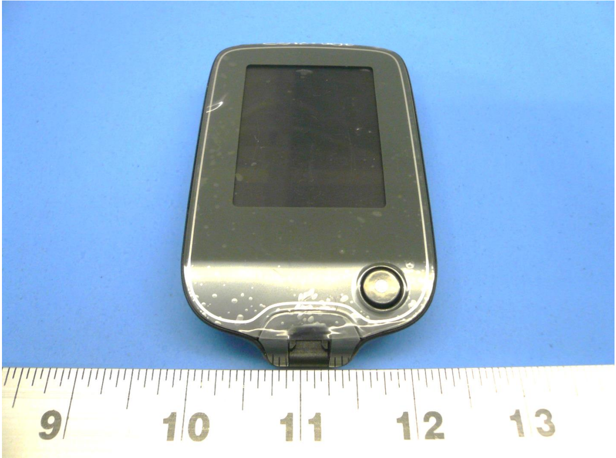
Figure 1: External Photo of EUT (Front)