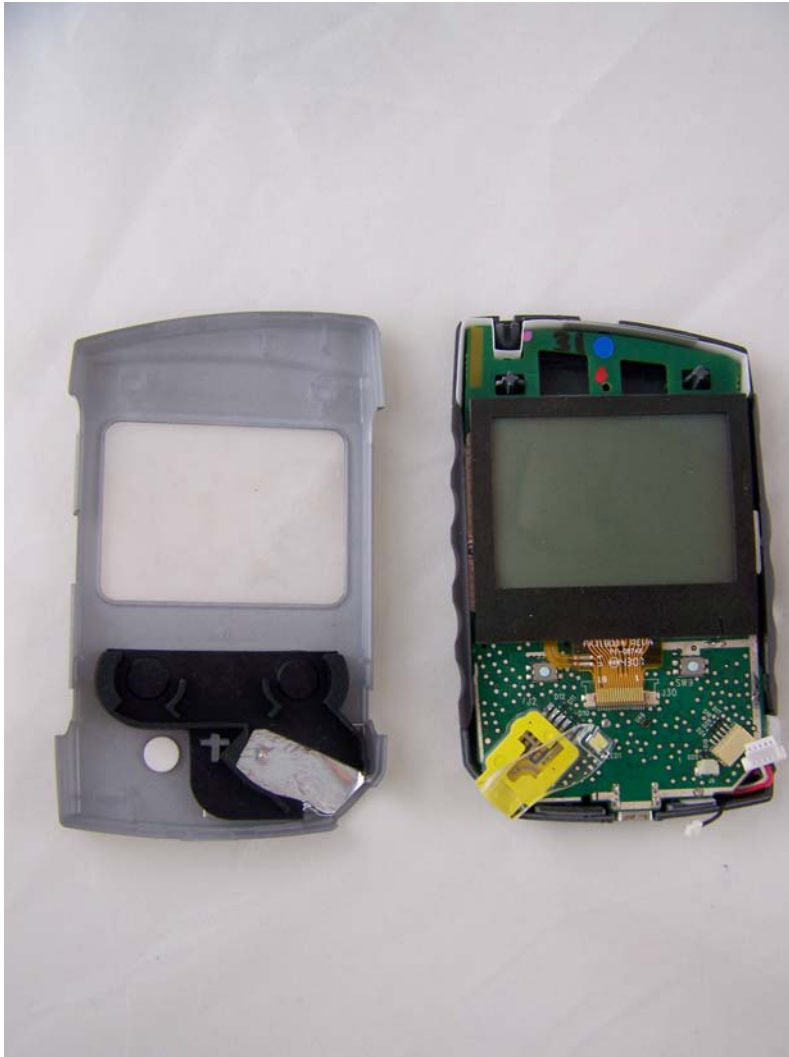
Front view exploded