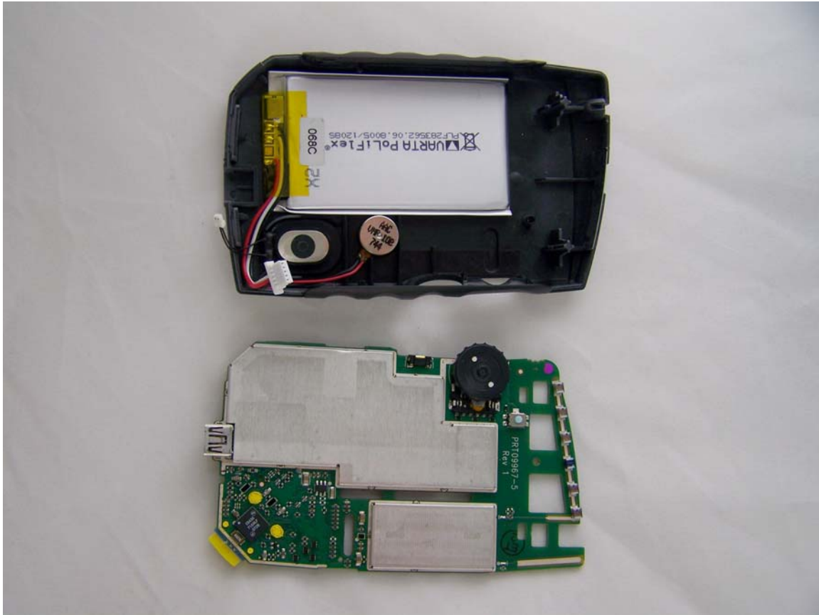
Rear view exploded