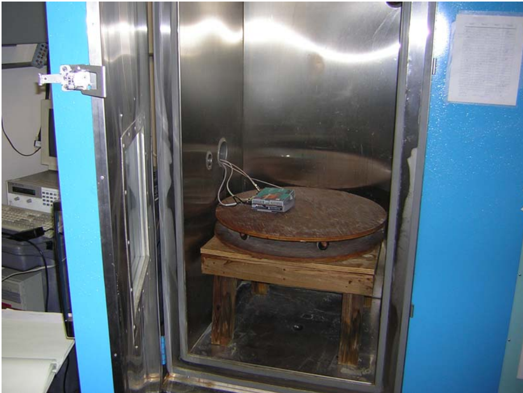
Frequency Stability – Door Open