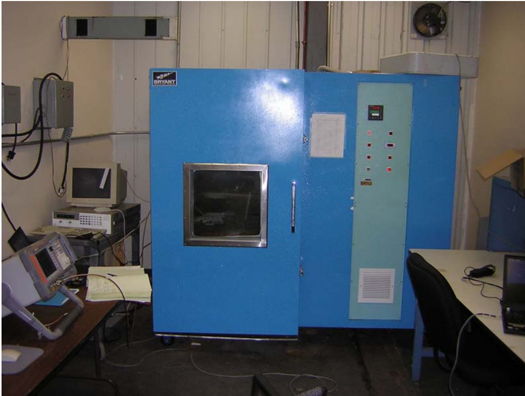
Frequency Stability – Door Closed