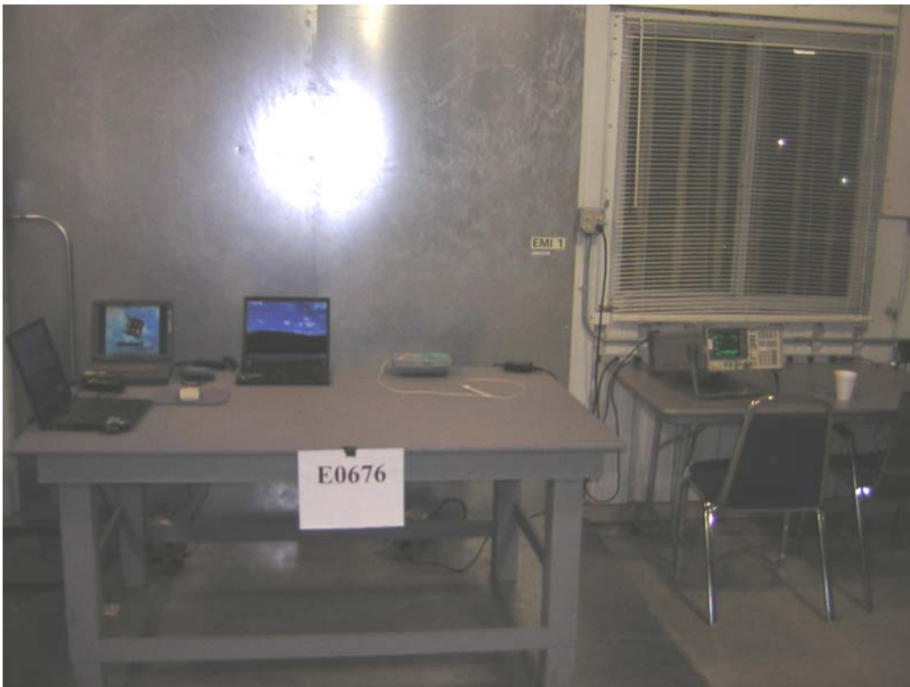
AC Line Conducted Emissions