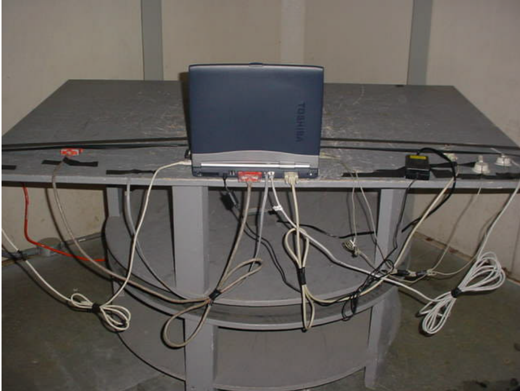
Spurious Emissions – Back