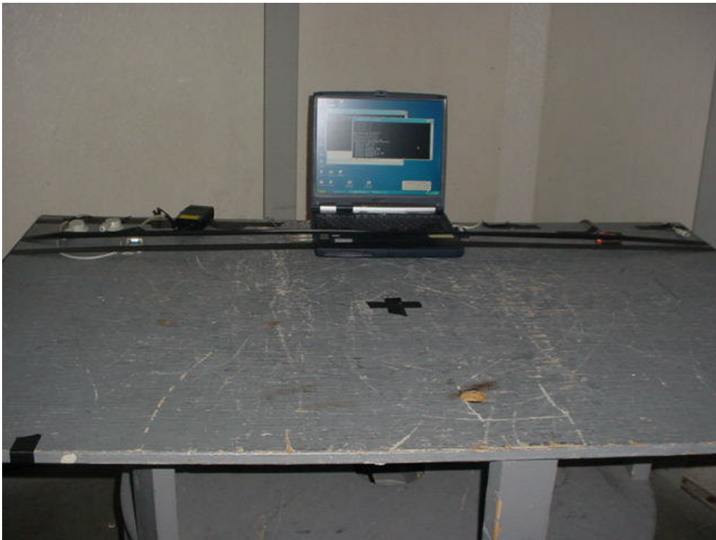
Spurious Emissions – Front