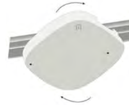
Figure 3 AP4000 or AP4000U access point ceiling install