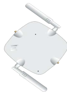
Figure 2 AP3000X access point hardware components