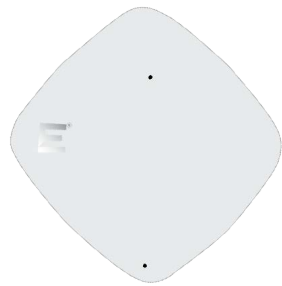
Figure 2 AP3000 access point hardware components