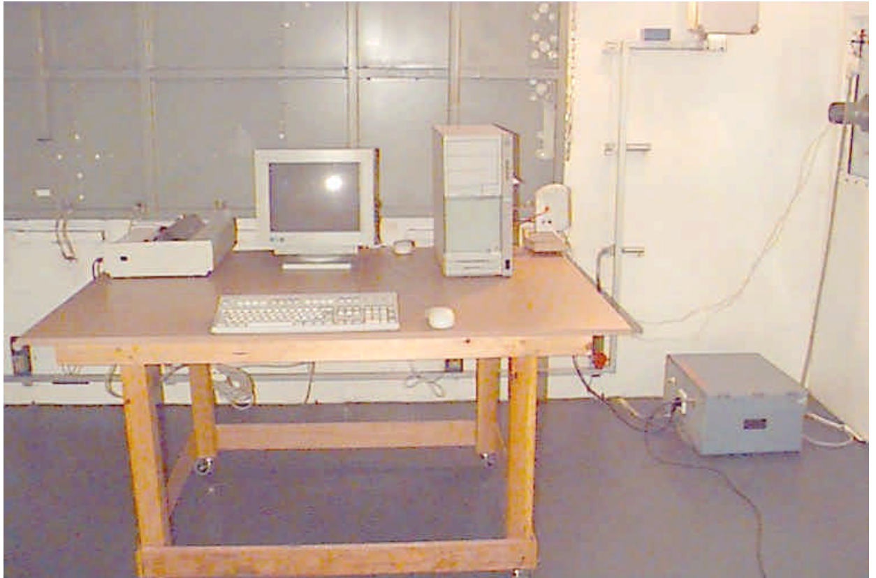
Photograph No.1 Conducted emissions measurement setup general view