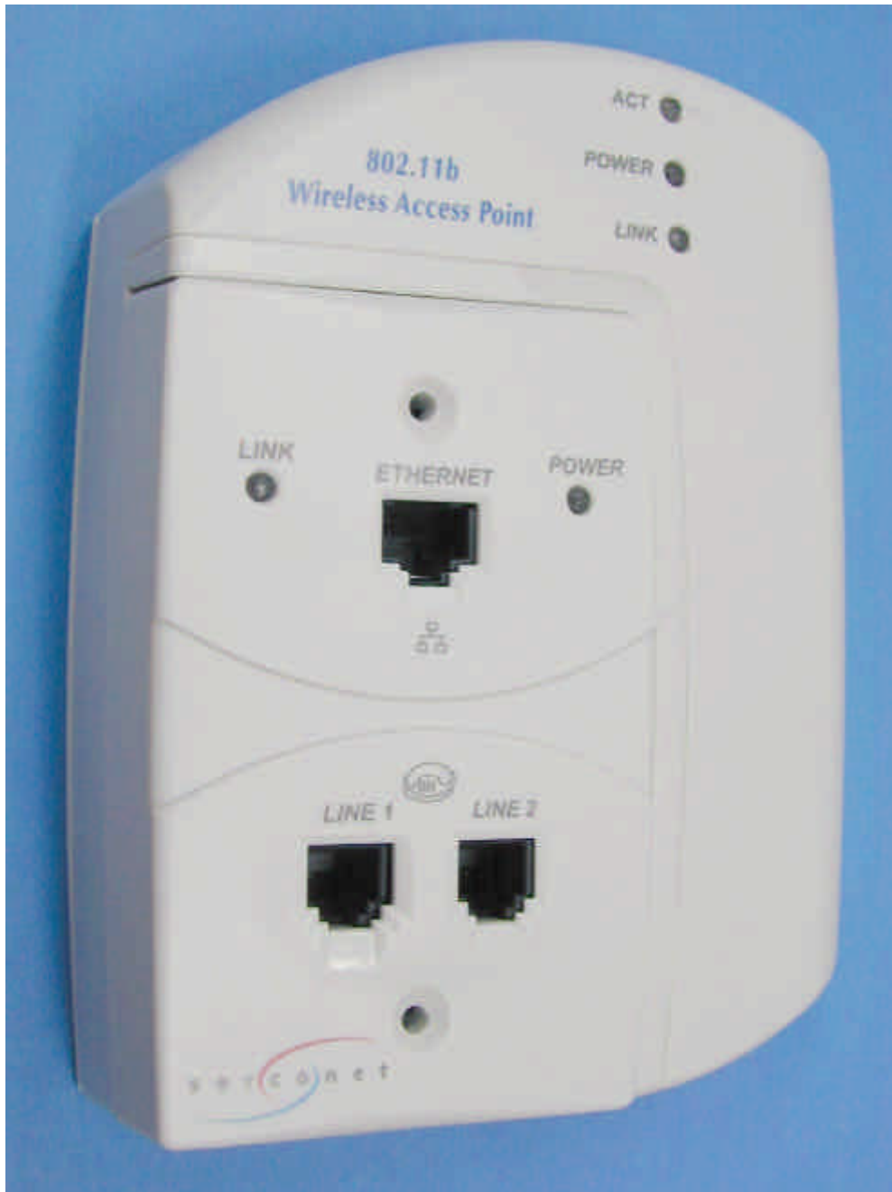
Photograph No.1 Wireless access point unit with outlet unit (EUT) general view