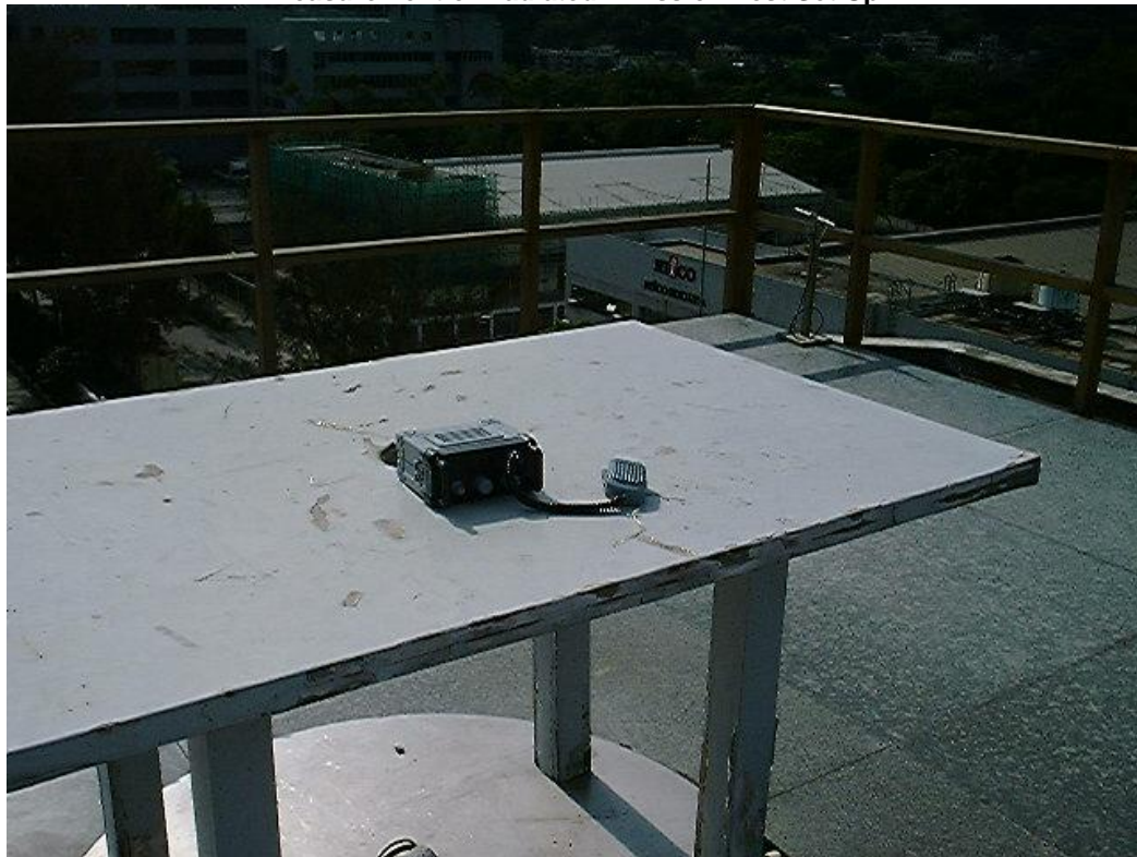
Measurement of Radiated Emission Test Set Up