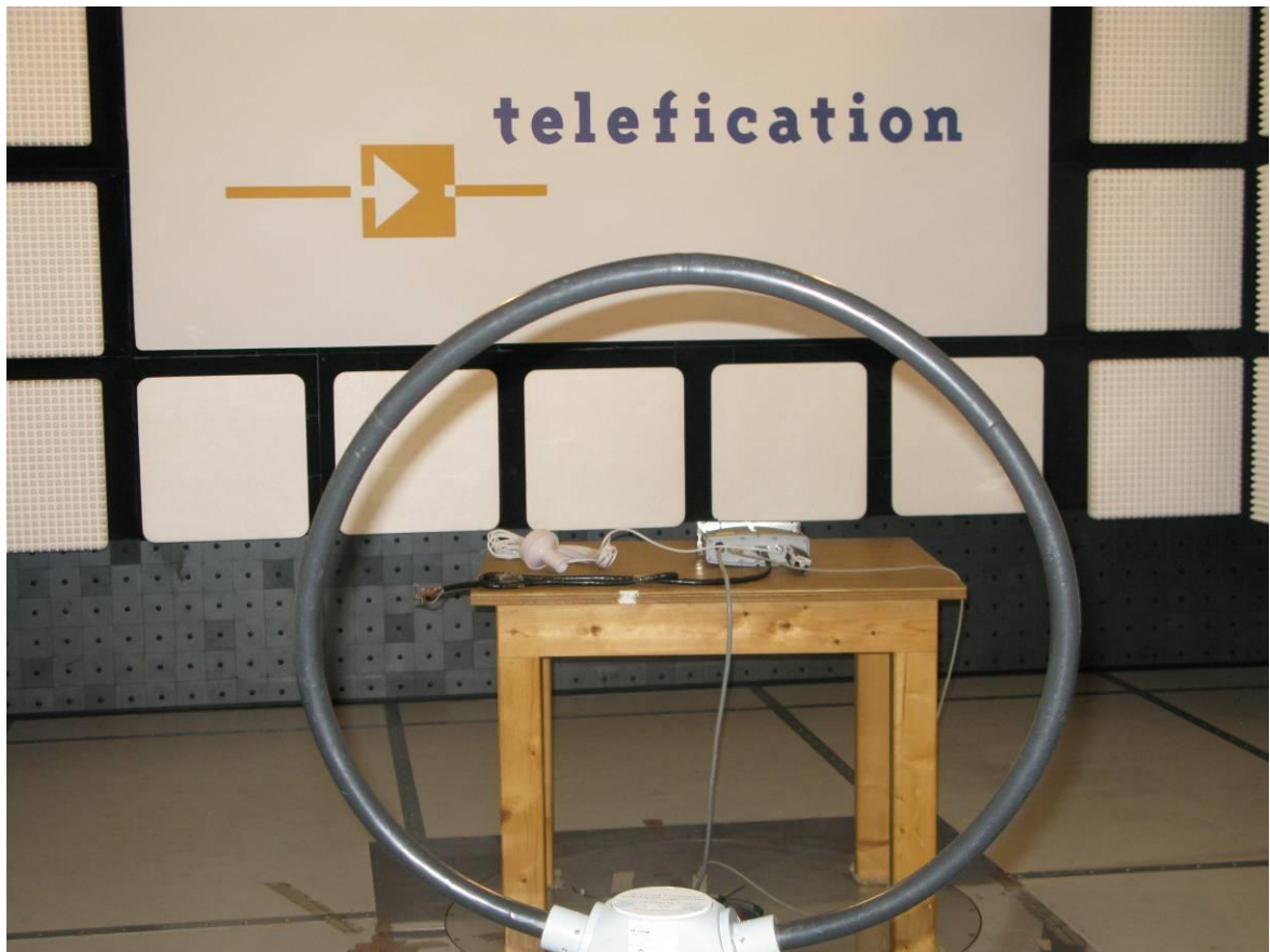
Photograph 1: Radiated emissions test set up, 0.15 – 30 MHz