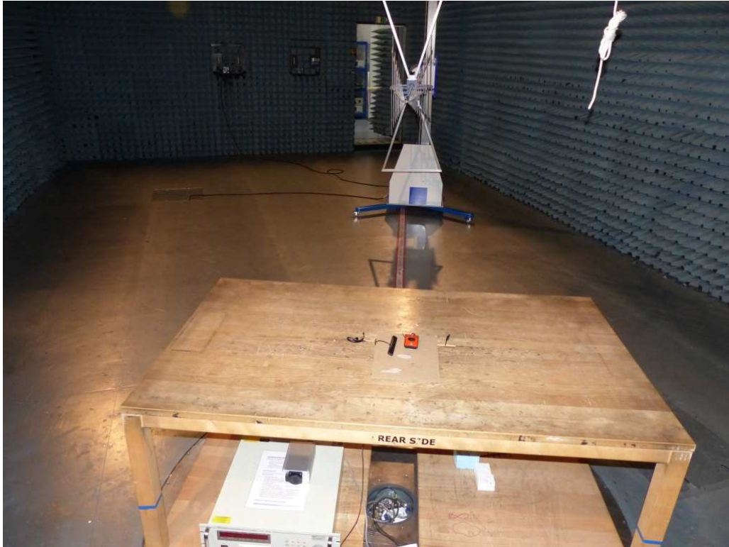
Photo 2: Test setup for radiated measurements (Enclosure, semi-anechoic chamber, 30 MHz to 1 GHz, intentional radiator §15)