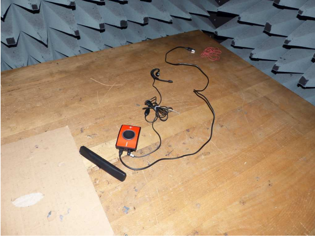
Photo 1: Test setup for radiated measurements (Enclosure, below 30 MHz, intentional radiator §15)