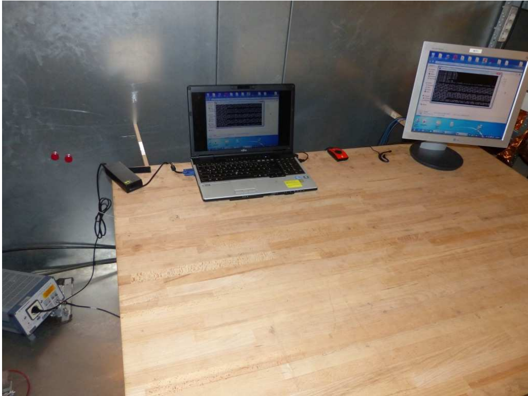
Photo 5: Test setup for conducted measurements (computer peripheral setup, EUT supplied by USB-cable from computer, charging mode, unintentional radiator §15)