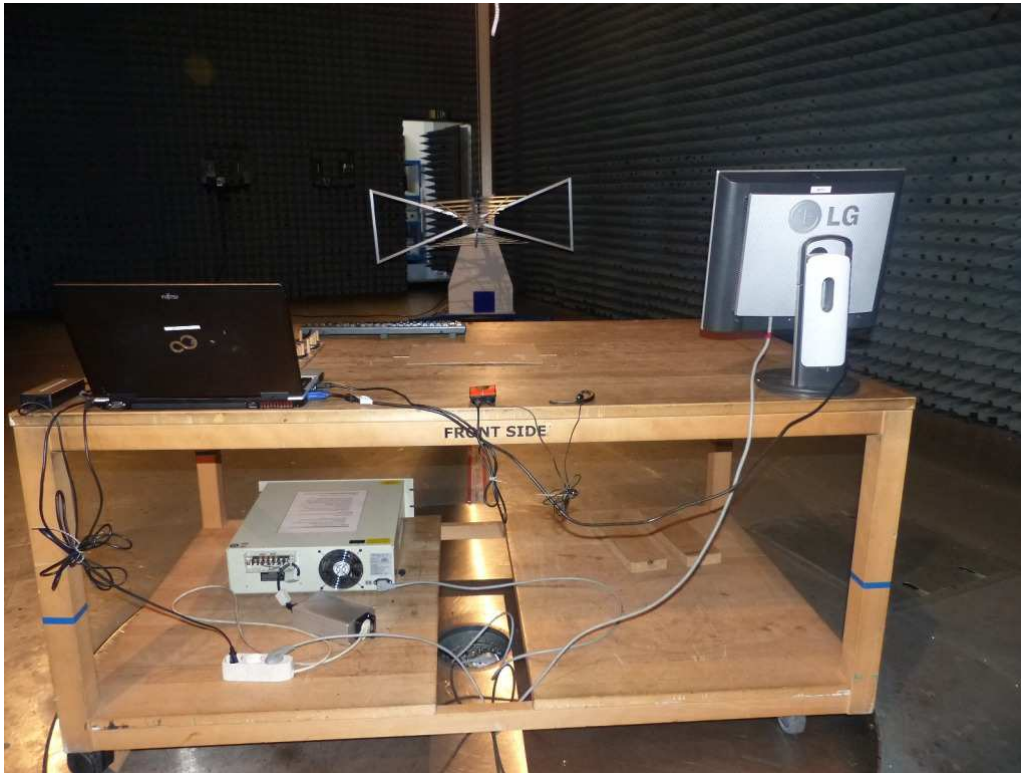
Photo 6: Test setup for radiated measurements (computer peripheral setup, EUT supplied by external DC power to enable USB data transfer to computer, unintentional radiator §15)