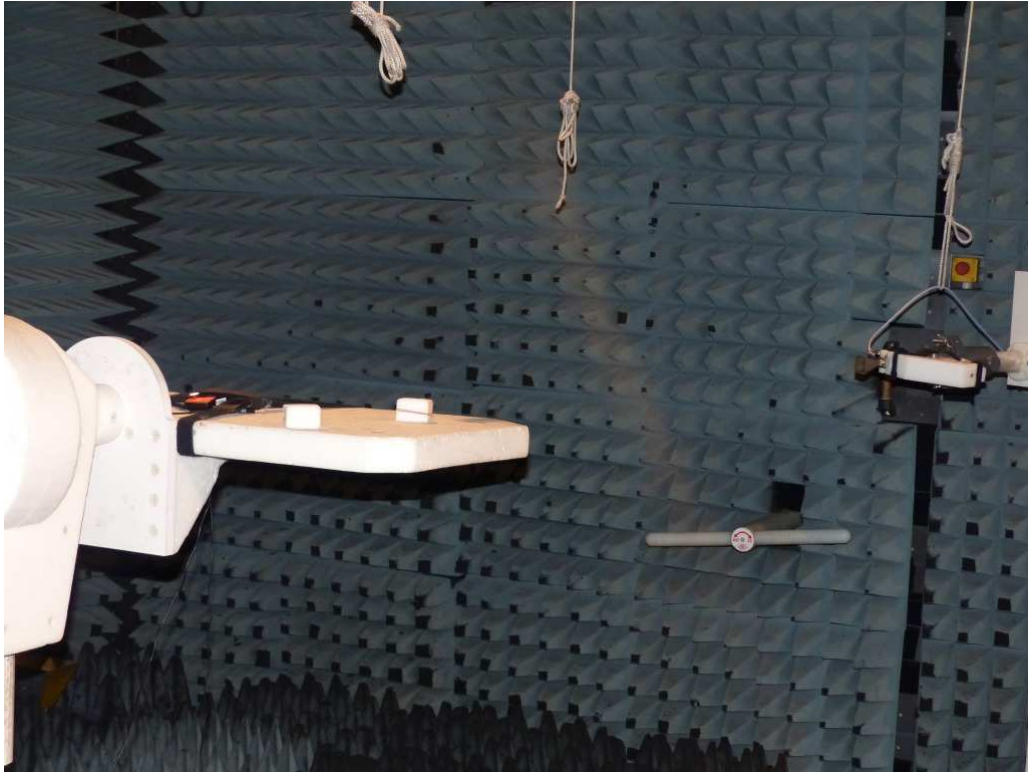
Photo 4: Test setup for radiated measurements (Enclosure, fully-anechoic chamber, 18-25 GHz, intentional radiator § 15.247)