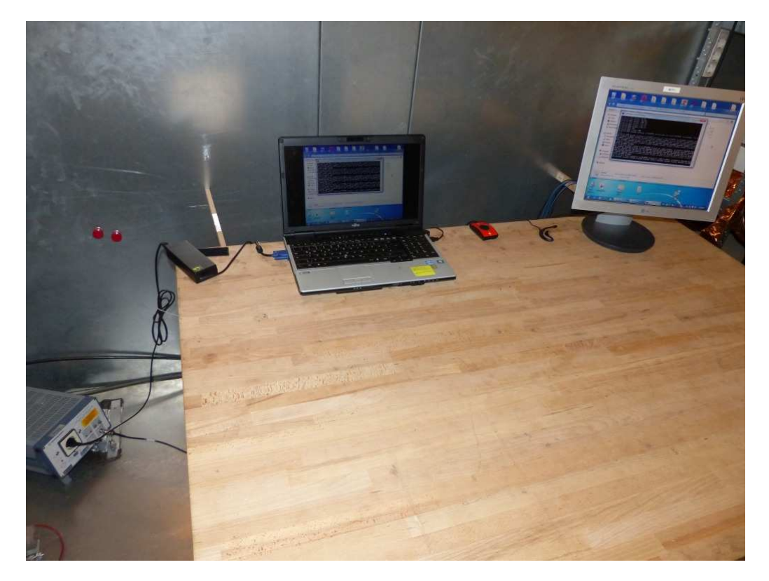
Photo 5: Test setup for conducted measurements (computer peripheral setup, EUT supplied by USB-cable from computer, charging mode, unintentional radiator §15)