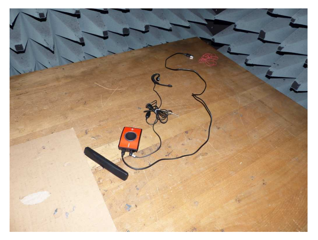
Photo 1: Test setup for radiated measurements (Enclosure, below 30 MHz, intentional radiator §15)