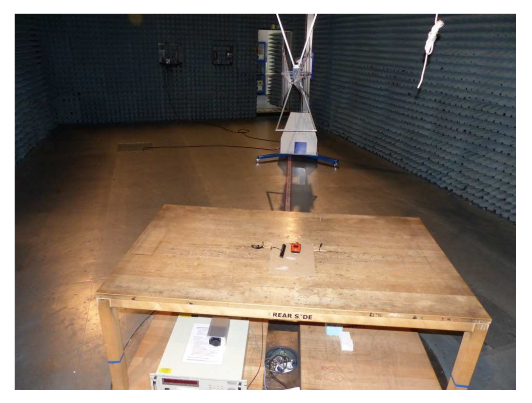
Photo 2: Test setup for radiated measurements (Enclosure, semi-anechoic chamber, 30 MHz to 1 GHz, intentional radiator §15)