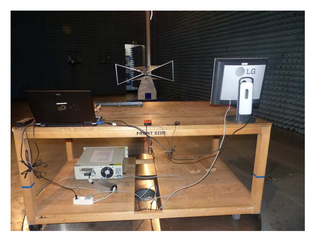
Photo 6: Test setup for radiated measurements (computer peripheral setup, EUT supplied by external DC power to enable USB data transfer to computer, unintentional radiator §15)