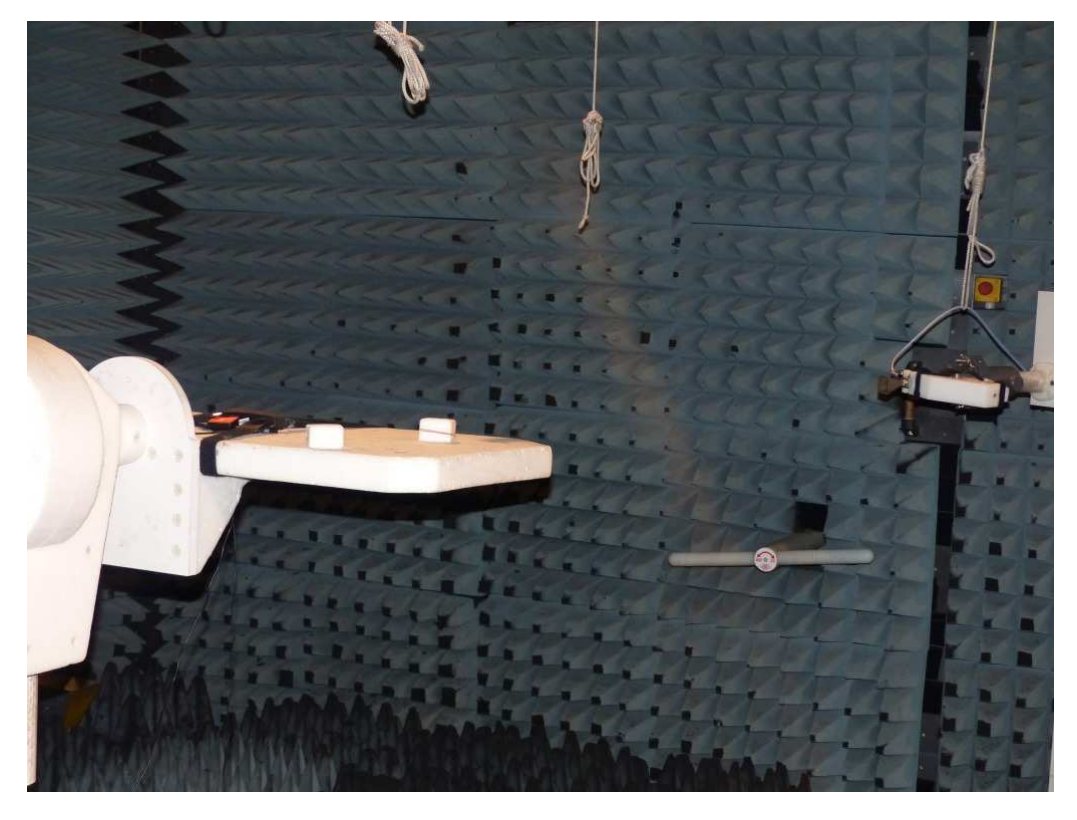
Photo 4: Test setup for radiated measurements (Enclosure, fully-anechoic chamber, 18-25 GHz, intentional radiator § 15.247)