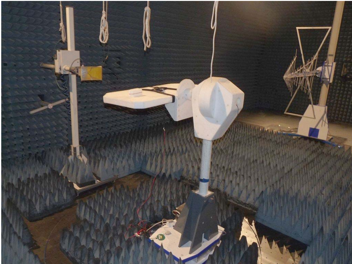
Photo 2: Test setup for spurious radiated emissions measurements (Enclosure, fully-equipped anechoic chamber, 30 MHz -1GHz intentional radiator §15)