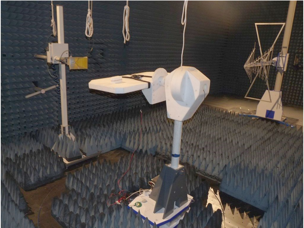
Photo 2: Test setup for spurious radiated emissions measurements (Enclosure, fully-equipped anechoic chamber, 30 MHz -1GHz intentional radiator §15)