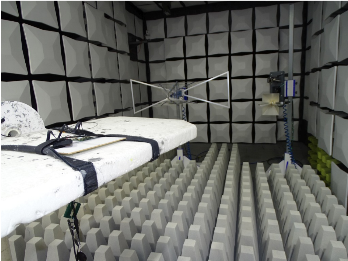
Photo 2: Test setup for radiated measurements (stand alone, EUT supplied by a battery, unintentional radiator §15.109, ANSI C63.4) Above 1 GHz