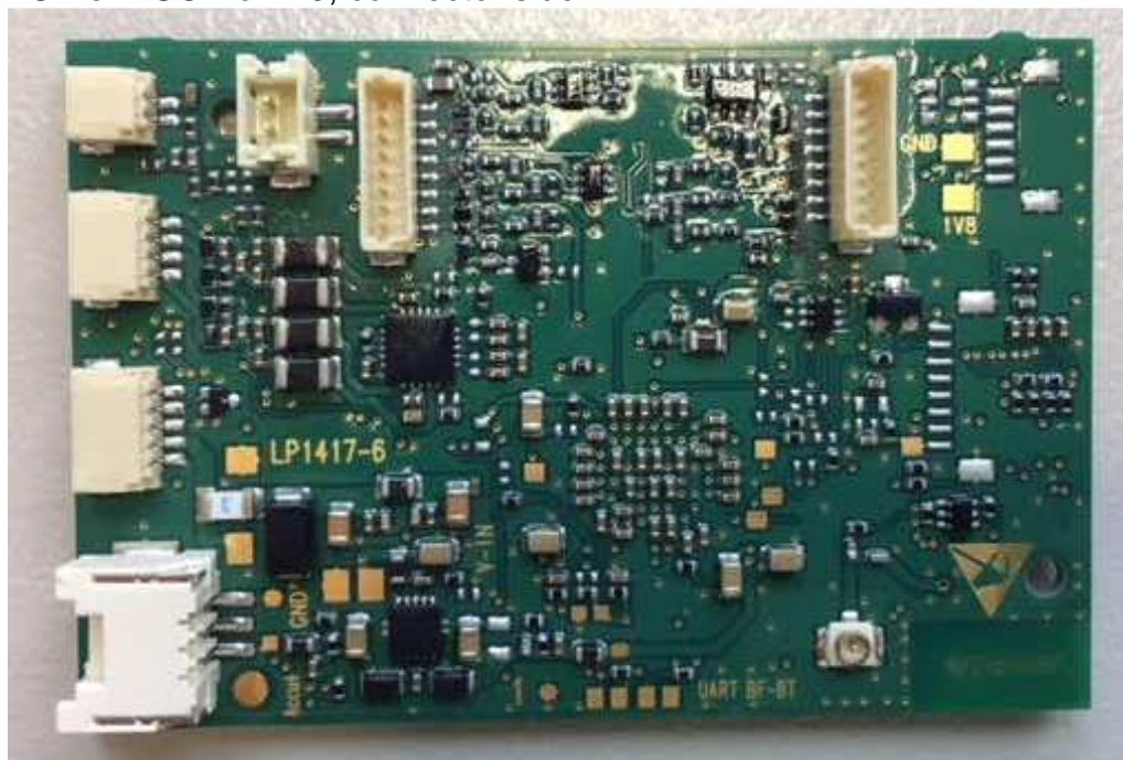
PCB of HSG KomV3, internal antenna side