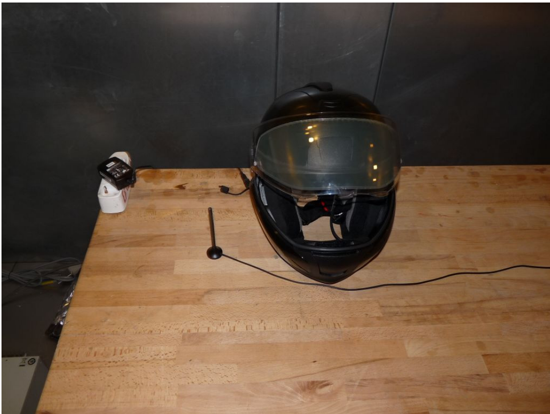
Photo 4: Test setup for conducted measurements (AC Port (power line))