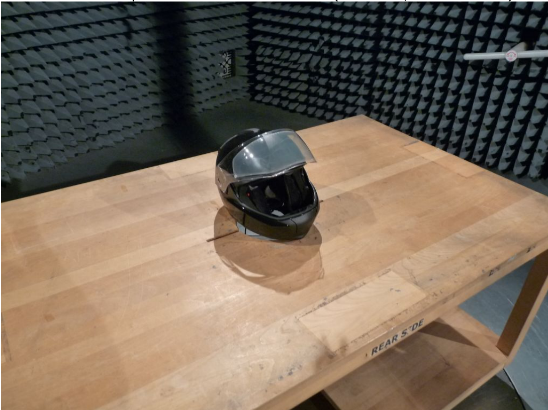
Photo 2: Test setup for radiated measurements (Enclosure, 30 MHz to 1 GHz)