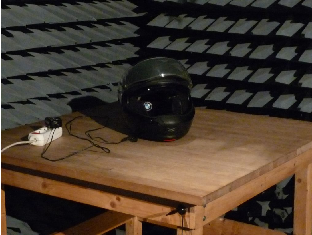
Photo 1: Test setup for radiated measurements (Enclosure, below 30 MHz)