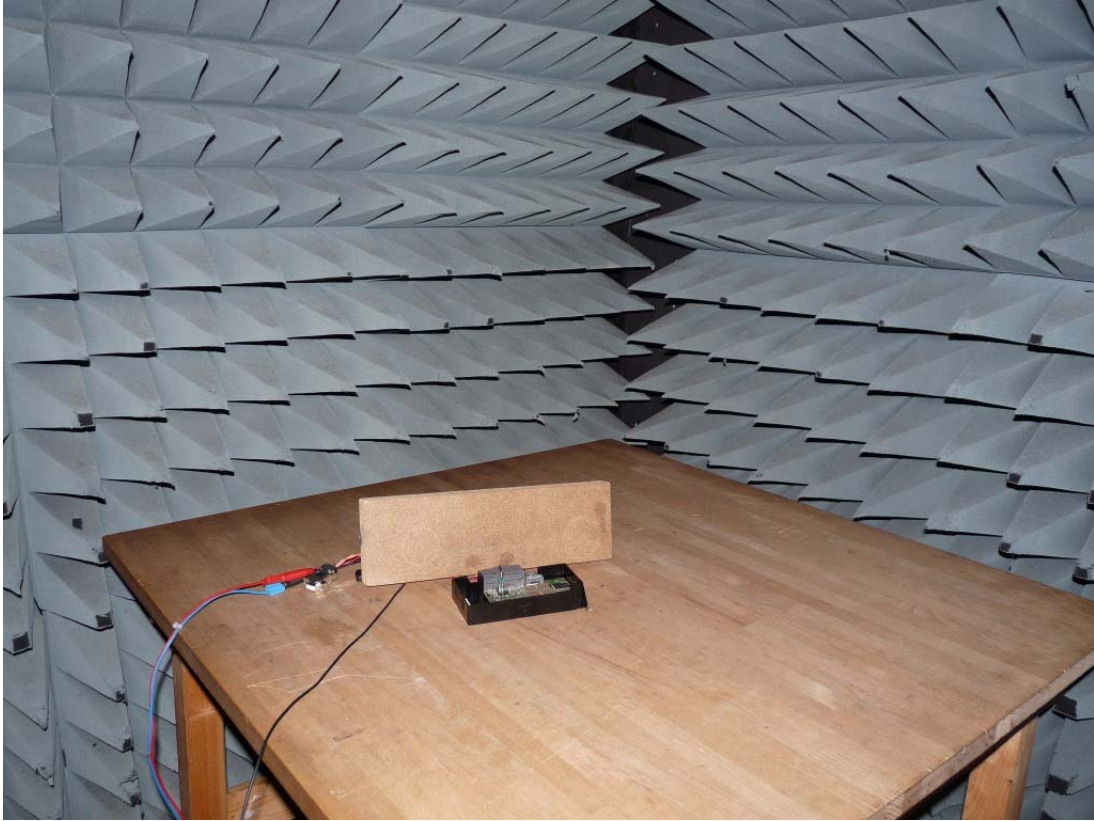
Photo 1: Test setup for radiated measurements (Enclosure, below 30 MHz)