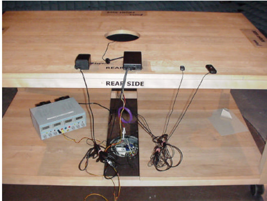
Picture 1 : Setup for the test "Spurious radiated emissions" up to 1 GHz