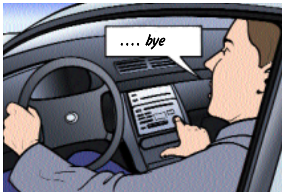
To end the call, push the same button once again

Voice Recognition is started by pushing the upper or middle button with following features: