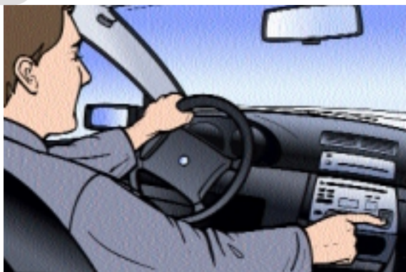
Answer your calls simply by pushing the middle button on the remote control