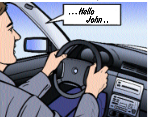
You may now have your conversation via the Bluetooth™ handsfree system