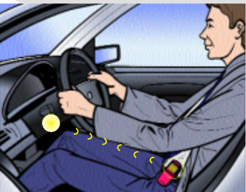
Automatic connection is established between the cell phone and the handsfree system