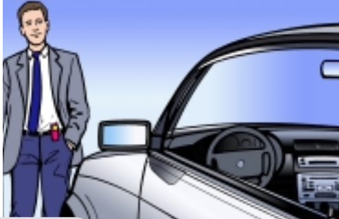
Get into the car and turn on the ignition