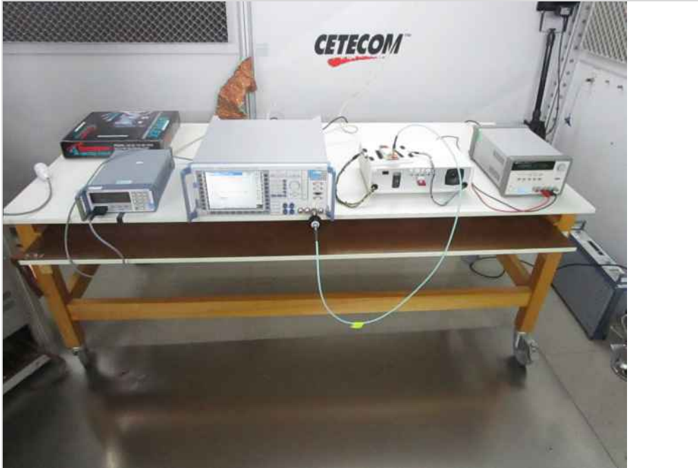
Photograph 5: EUT Setup Conducted RF power