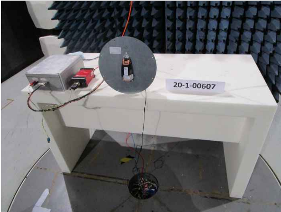
Photograph 3: EUT Test Setup in the semi anechoic chamber, close up view