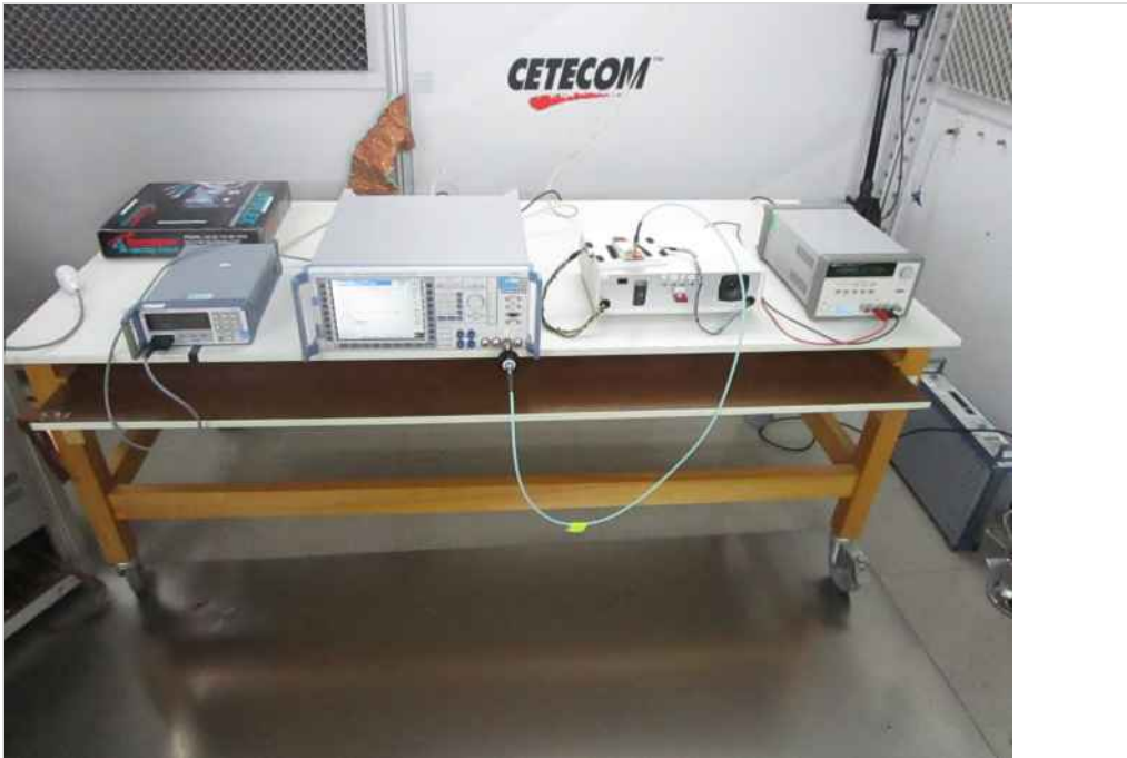
Photograph 5: EUT Setup Conducted RF power