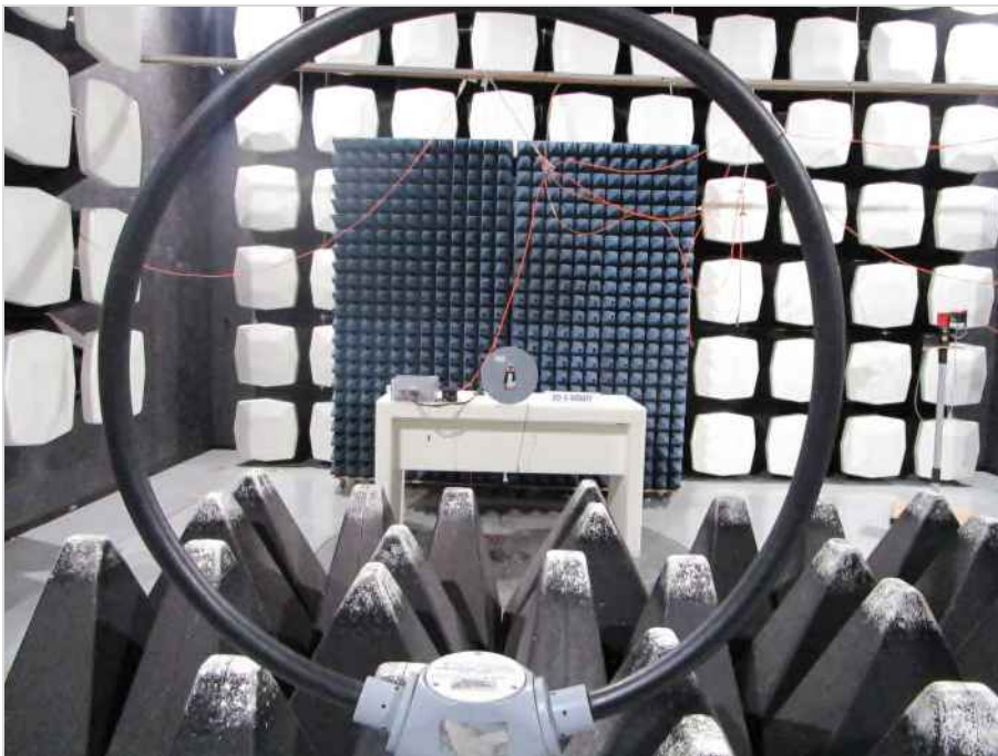
Photograph 4: EUT Test Setup in the semi anechoic chamber, overview